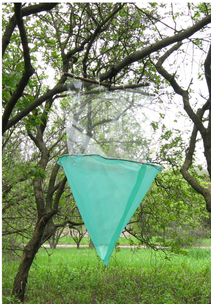
FIGURE 1. Left, construction of Petrov window traps; right, window trap in arboretum of the Donetsk Botanical garden, May 2010. Legend: 1. wooden slats, 2. plastic sheets, 3. wire ring, 4. plastic funnel, 5. water or ethanol.

X. attenuatus has been recorded from all climatic zones and is known from nine administrative provinces of the country (Nikulina et al. 2007a). T. destruens is deemed here to be an invasive species, since the unique find of that species refers to 1981 (Khaustov & Nikulina 2008). However, precise identification of T. destruens from very similar T. piniperda became possible only recently owing to papers by Kohlmayr et al. (2002), Faccoli (2006) and Kirkendall et al. (2008). Considering occurrence of T. destruens in Crimea, one can suggest it has bred in the southern coast of the peninsula since introduction along with Mediterranean pine species, Pinus halepensis and Pinus pithyusa , at least several centuries ago. Alternatively T. destruens might be a native in Crimea breeding on Pinus stankewiczii which is known from Sudak and Sebastopol, but after introduction of related Pinus halepensis in the culture T. destruens become more abundant. Both these phylogeographic hypothesis might be tested using molecular markers that is matter of further study. Taxonomic status of C. subcribrosus , that is very similar to Palaearctic C. cinereus , was established by morphological and molecular analysis (Jordal & Knížek 2007) and we