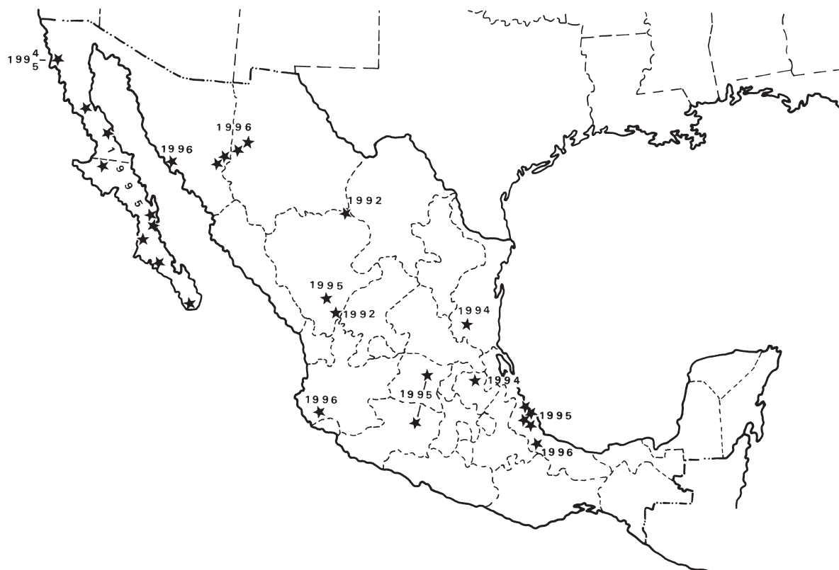
Fig. 1. Dispersal of E. intermedius in Mexico after its introduction in the U.S.A. Collection sites are marked by stars and collection years are indicated to one side. See text for discussion about the presumed dispersal routes followed by E. intermedius into Mexico.

(San Carlos) as the result of its having successfully crossed the coastal desert. Its presence in Jalisco may be the result of an expansion southward along the Pacific coast (as happens in D. gazella ) or to a rapid descent from the Plateau. We have no records from Sinaloa and Nayarit which would support the former hypothesis. D. gazella reached Guatemala in 1987 via Gulf of Mexico coastal plains (Kohlmann, 1994). E. intermedius , on the contrary, has just arrived (1995) to central Veracruz, an arrival date we consider accurate because central Veracruz is regularly and systematically sampled by Institute of Ecology personnel. On the Mexican Plateau D. gazella arrived at Mapimí in 1984 (a reliable first arrival date) and its southern penetration limit is in San Luis Potosí, achieved in 1987 (Kohlmann, 1994). E. intermedius arrived in Mapimí and La Michilia in Durango (1992) and southern to the states of Guanajuato and Michoacán.