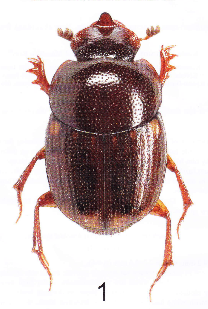
Fig. 1. Onthophagus (Onthophagus) koechlei sp. nov., habitus (holotype, male).

finely bordered; lateral margins gently rounded in front, nearly straight or scarcely sinuate behind, finely bordered; anterior angles distinctly produced forward, with apex rectangular or slightly obtuse; posterior angles obtuse; basal margin obtusely angled at the middle, not bordered; disc evenly and not so strongly convex dorsad, without trace of depression or tubercle; surface moderately, partly, rather sparsely covered with strong punctures, which become slightly larger laterad, with interspace between punctures smooth and polished.