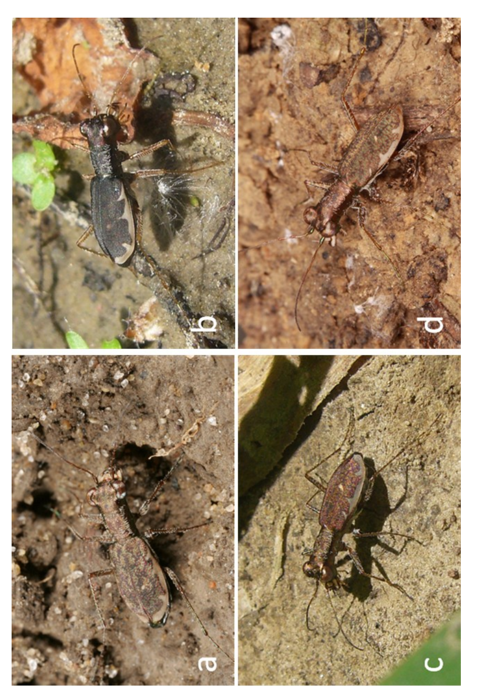
Figure 2. Cylindera cursitans in southeast Missouri: a) New Madrid Co., Girvin Memorial Conservation Area, 6.vii.2007; b-c) Mississippi Co., Dorena Ferry Landing, 6.vii.2008; d) Mississippi Co., Hwy 60 at Mississippi River bridge, 20.vi.2009.