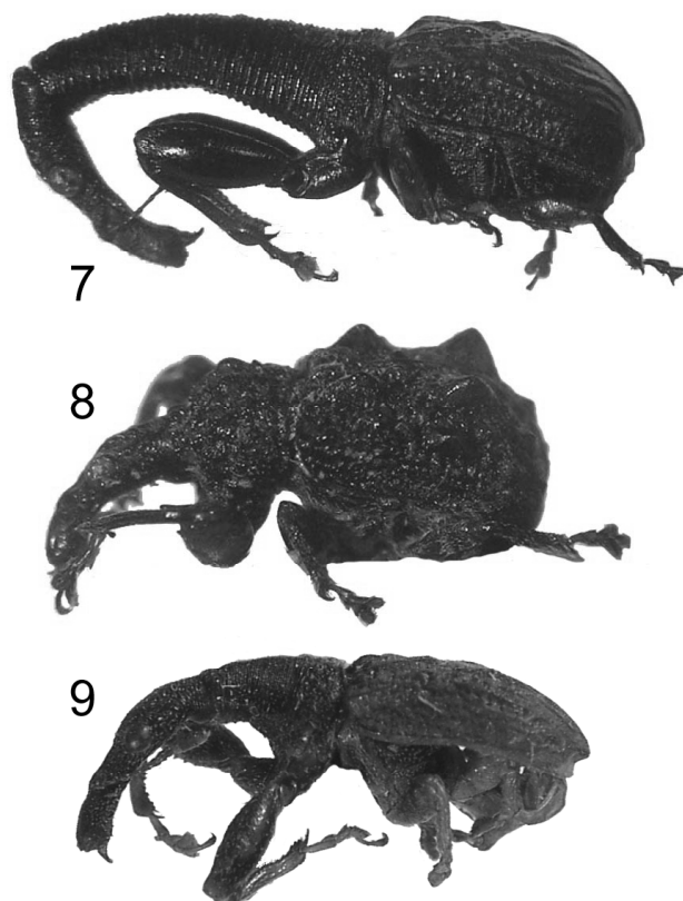
Figs. 7-9. Lagenoderus sp. (laterally): 7 – L. dentipennis (male), 8 – L. dentipennis (female), 9 – L. fairmairei (male).

Meso- and metathorax with episternum densely rugosity-punctate. Mesepisternum narrow. Metepisternum wide.