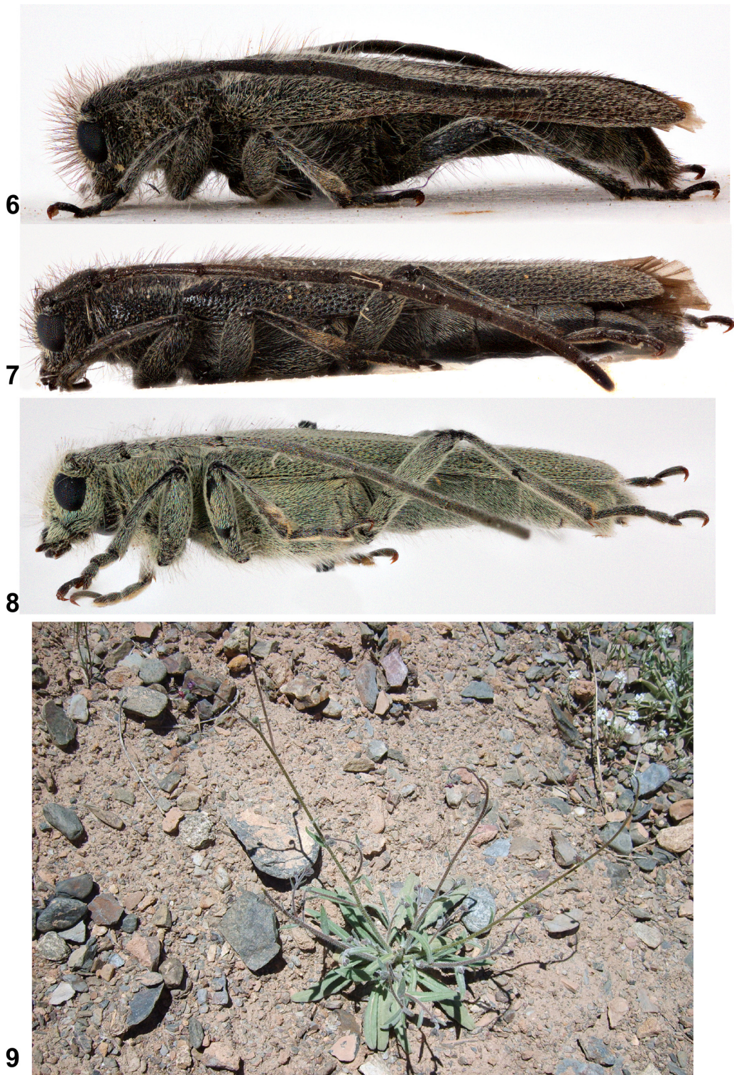
Figs 6–9. Species of Phytoecia ( Opsilia ), lateral view, and biotope.

Рис. 6–9. Виды Phytoecia ( Opsilia ), вид сбоку; биотоп.