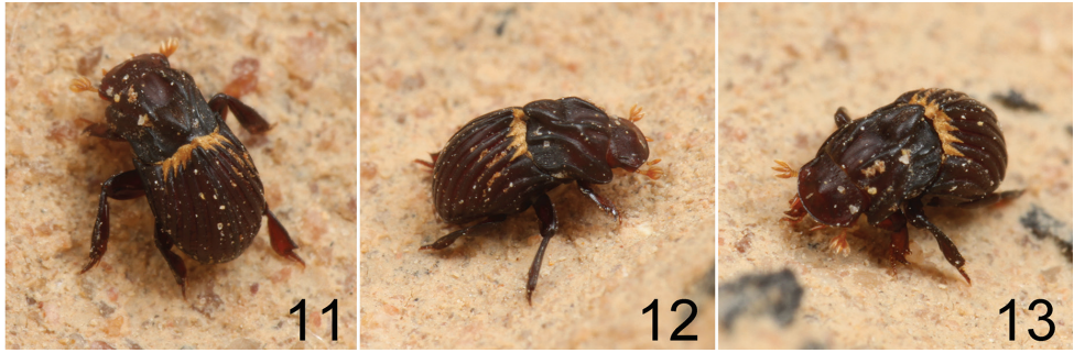
Figures 11–13. Living Termitotrox venus sp. n. walking on a wall of the host termite nest inside.

of femur dark brown, broadly elliptic in outline, distally emarginate, surface moderately micropunctate, glabrous. Mesotibia dark brown, with several setae, broad, dilated near base, nearly parallel-sided from apex, edges entire; tibial apex deeply emarginate, with pair of acuminate apico-internal spurs, external one long, slightly curved, internal one short, straight; upper side of mesotibia with fine longitudinal ridge near outer edge, weak costa at basal half, underside with fine sinuate ridge from base to apico-internal section; with long setae around apical quarter. Metatibia similar to mesotibia, but gently dilated apicad, with apex shallowly emarginate. Meso- and metatarsi dark brown, compacted-complanate, segments 1–4 short. Length of outer apical spur of metatibia 1/4 of metatibia, reaching base of tarsal segment 5. Aedeagus (Figs 9, 10).