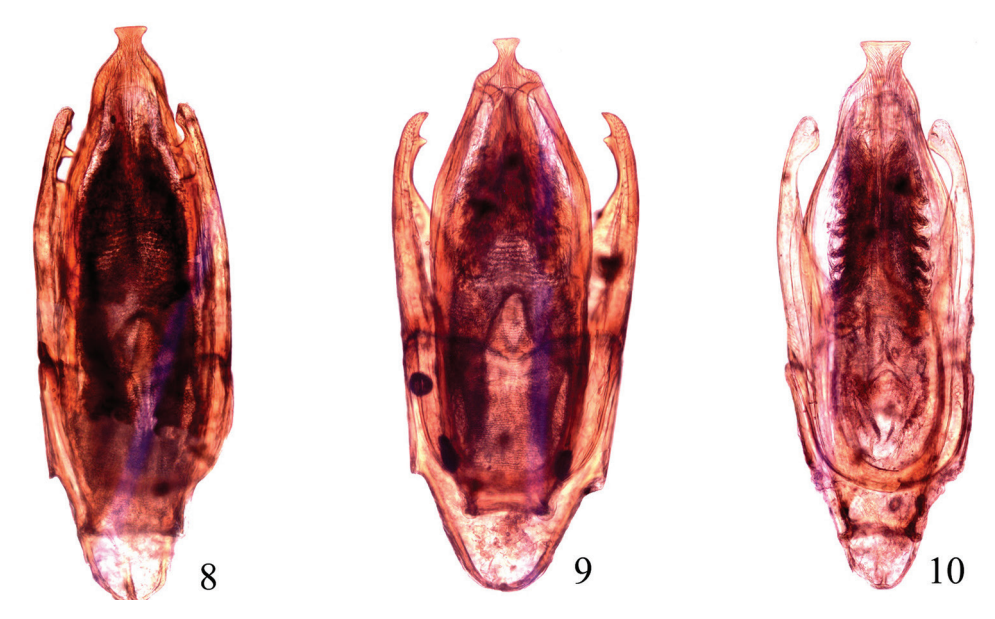
Figures 8–10. Aedeagi (dorsal view): 8 Chasmogenus parorbus sp. n. 9 C. orbus Wlatanabe 10 C. abnormalis Sharp.

Macau: 2 females (SYSU), Cotai Ecosystematic Reserve, part 1, 8.iv.2014, Weicai Xie et Jinwei Li leg. [transcribed from Chinese].