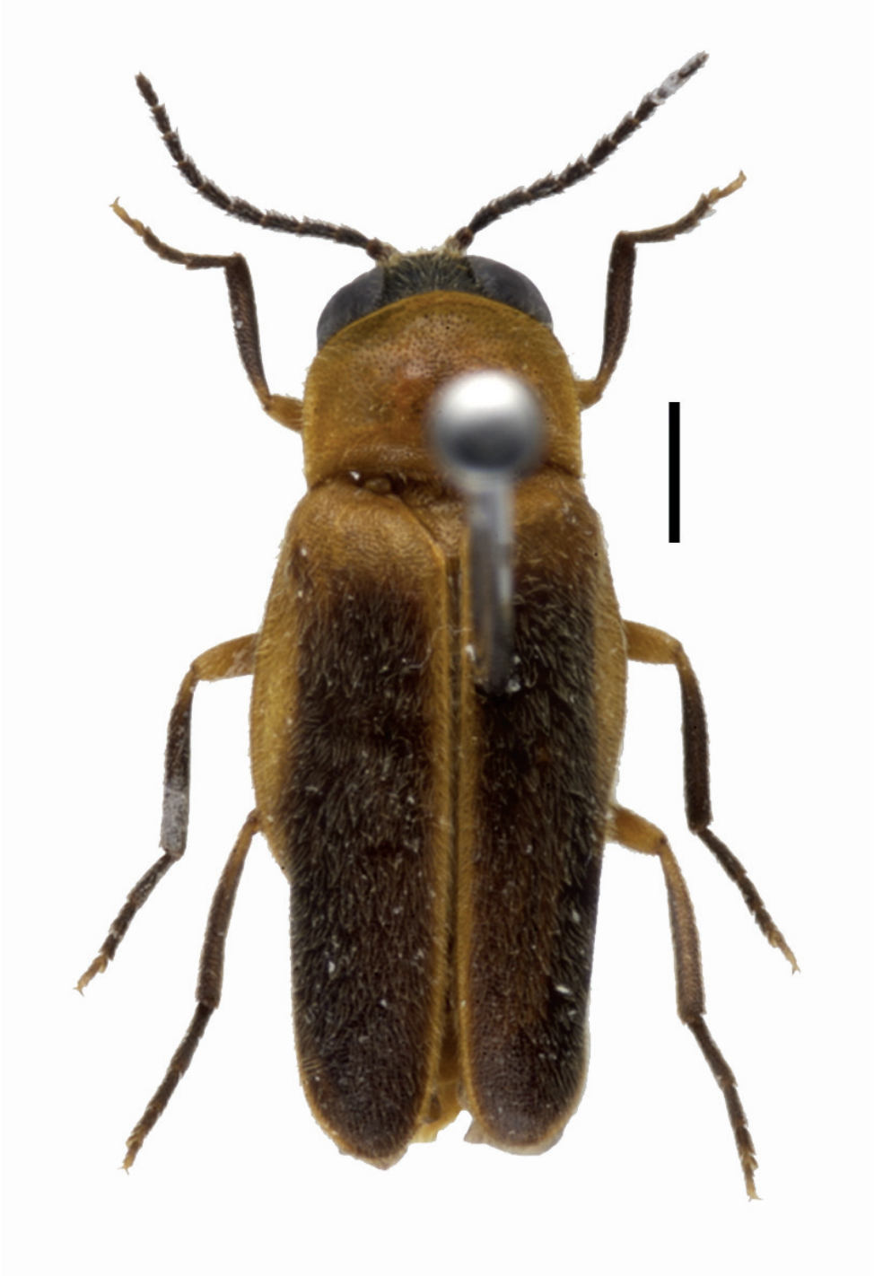
Figure 1. Habitus of male of Oculogryphus bicolor sp. n. Scale bar = 1.5mm. Elytra somewhat twisted in outer margin of apical half due to dehydration.