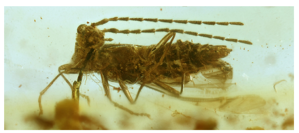
Fig. 2. Malthodes meriae sp. nov.: Holotype, ventral view.