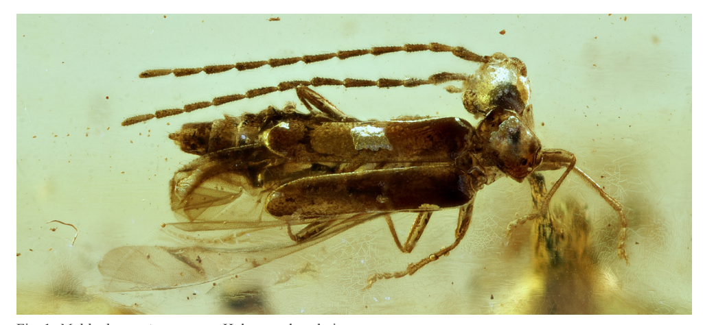
Fig. 1. Malthodes meriae sp. nov.: Holotype, dorsal view.

Penultimate tergite (tg9) robust, subquadrate, with margins equipped with setae; last tergite (tg10) very narrow, slightly elongated and lobe-shaped, at apex submillimetrically forked and equipped with long setae; last sternite (st9) elongated, narrow, not curved,