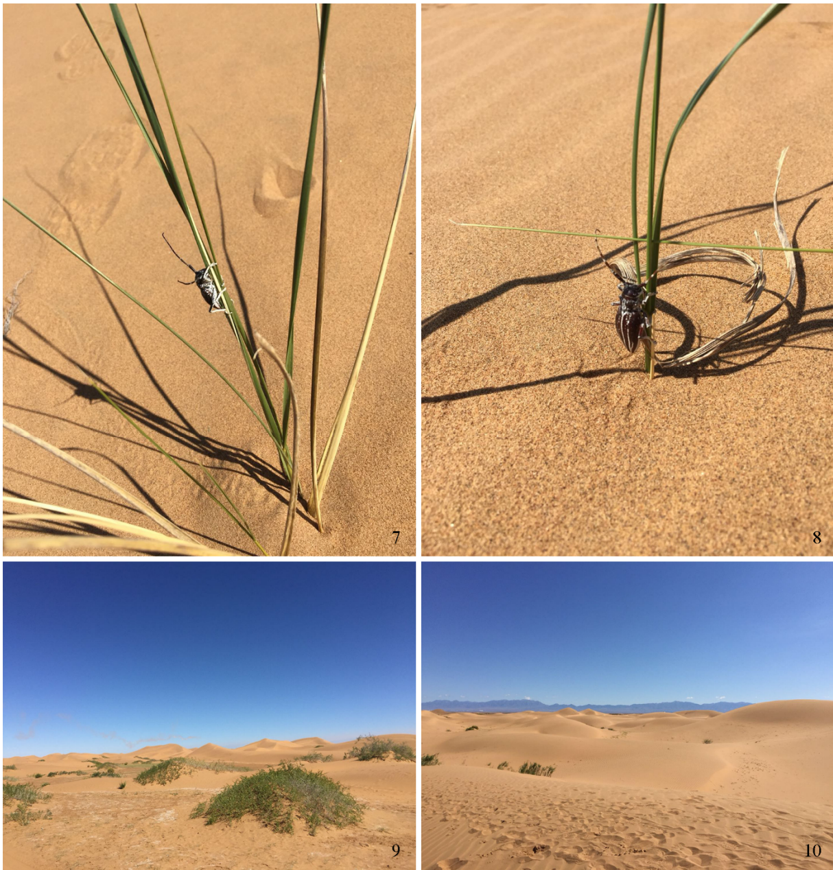
Figures 7–10. Biological pictures of Eodorcadion (Ornatodorcadion) zhaoi sp. nov. 7. Male on the food plant. 8. Female before oviposition. 9–10. Landscape of the localities.