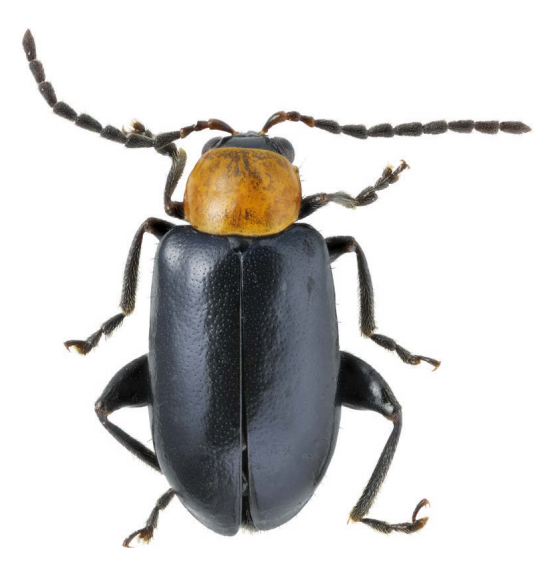
Fig. 1. Female of Luperomorpha xanthodera from Russia, city of Sochi, the Black Sea shore, dorsal view.

Malo, which is connected with Great Britain with many ship lines (Doguet 2008). In 2006 L. xanthodera was recorded to be common in two localities in Italy (Conti & Raspi 2007). Now it is widely spread over France (Vincent & Doguet 2011), Germany (Döberl & Sprick 2009) and The Netherlands (Beenen et al. 2009), and occurs also in Switzerland (Döberl & Sprick 2009), Hungary (Bodor 2010, 2011), Belgium (Fagot & Libert 2016), Austria (Geiser & Bernhard 2012) and Poland (Kozłowski & Legutowska 2014). Luperomorpha xanthodera is definitely established in France and Italy, but it is unclear, if it is established in other European countries, since all findings were made in or near garden-centers or on recently imported plants. We have found L. xanthodera much east of all previously known localities in Europe, namely in Sochi (Russia).