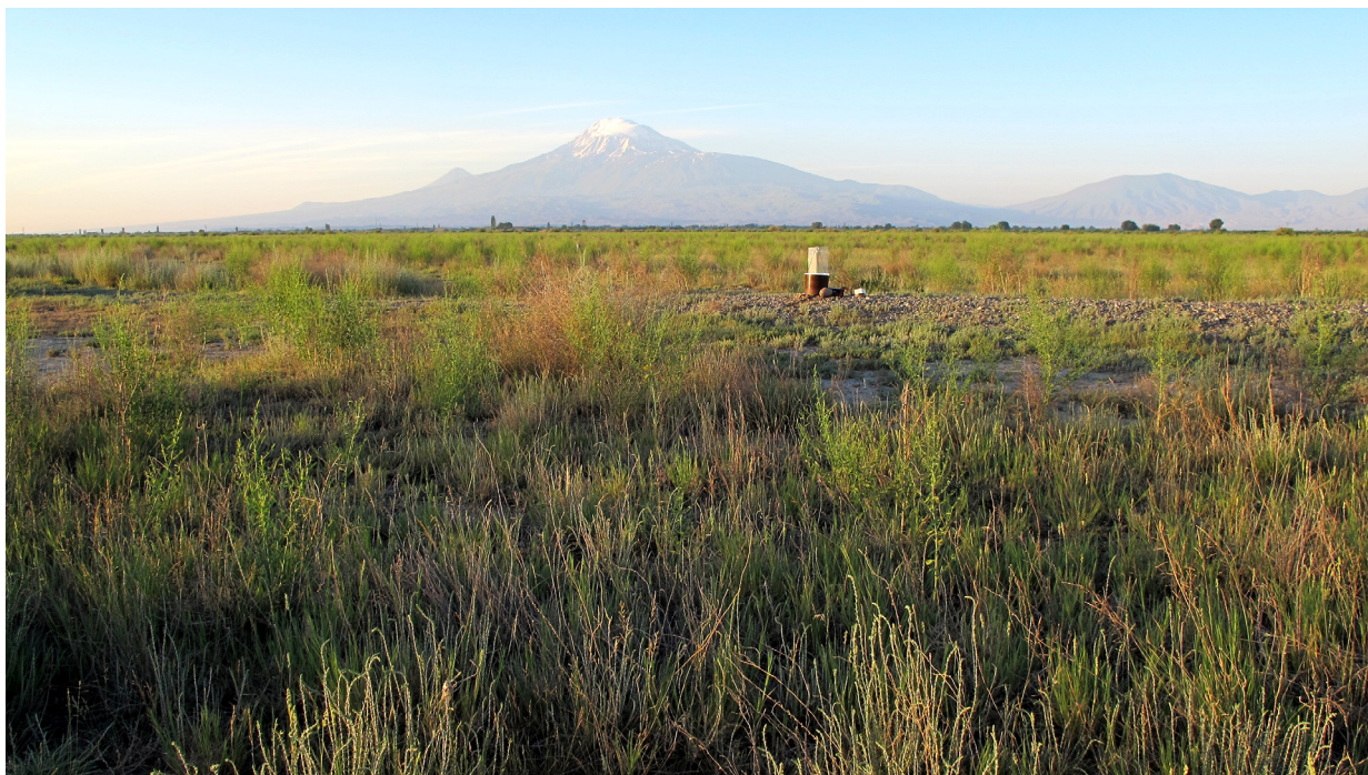
FIGURE 17. “Vordan Karmir” State Sanctuary, Armenia – the biotope of Anoxia (Protanoxia) maljuzhenkoi (Zaitzev, 1928). Photograph by Jan Šumpich, June 2017.

Pronotum transverse, moderately convex with distinct longitudinal groove in the middle, widest approximately in the middle. Basal border present, broadly interrupted in the middle, lateral borders complete, anterior border missing. Lateral margins weakly crenate. Anterior margin regularly, broadly sinuate. Anterior angles obtuse-angular; posterior angles broadly rounded. Punctuation consisting of coarse, irregularly-spaced punctures becoming denser in the longitudinal groove, each puncture bearing white, scale-like, recumbent macroseta; two rounded, impunctate, bare lateral areas on each side of pronotum present.