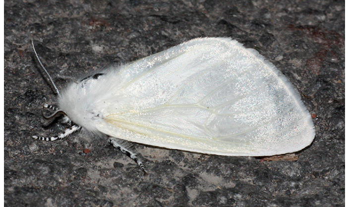
Figure 2: Leucoma salicis , the Satin Moth [USA: Oregon: Klamath County: Klamoya Casino (Highway 97 in Chiloquin): parking lot—2011 July 22 2:00 am].

Perhaps the biggest limitation of the key is that if you pick an ecoregion and the moth has not yet been collected there you can