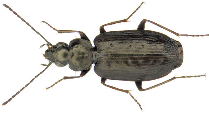
Figure 4. Sericoda quadripunctata (DeGeer, 1774) (~6 mm), a long-winged (+) pyrophile. Many species of carabids are black or dark brown. Sericoda spp. mimic the iridescent sheen of charcoal. Three of the four North American Sericoda species occur in Oregon. Lindroth (1961-69) states: "The species are excellent fliers and share a biological property, not yet understood: they are attracted to burning wood and sometime appear in great numbers during and after forest fires, already when ashes are still hot."

(Southwood 1977). The distribution and abundance of habitat types on the landscape strongly affects the species composition of regional carabid faunas. Habitat specialization can be roughly classified as xeric (dry), mesic (damp), and hygric (wet). Xerophiles tend to be sun-loving occupants of open shrublands, grasslands, and barren areas. Mesophiles are primarily in forest and woodland habitats. Hygrophiles are found in a wide variety of vegetation types from lowland forest swamps to exposed periglacial habitats at alpine elevations. Three other habitat specializations should be recognized even though the species represent only a small percentage of Oregon's fauna: haliophiles (alkaline lakes, salt marshes, sea beaches, etc.), arborealists (canopy dwellers), and pyrophiles (burned forests).