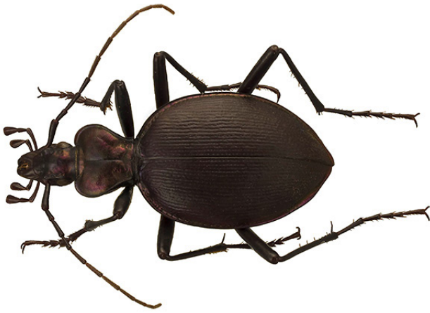
Figure 2. Scaphinotus hatchi Beer 1971 (~20 mm), a flightless mesophile endemic to Oregon, apparently restricted to montane forests of the Cascade Mtns. near Waldo Lake. Two closely related species, S. angusticollis and S. velutinus , are common and widespread in Oregon's coastal forest regions. The Columbia River appears to be a barrier to dispersal of S. velutinus north into Washington. Scaphinotus species are often described as molluscivores, however many of them probably have a much more catholic diet, including ripe berries.

rate a large collection and database of the species. Contrary to Mr. Piper's (1911) observations, I have found carabid beetles to be great subjects for study in the Pacific Northwest for many reasons: