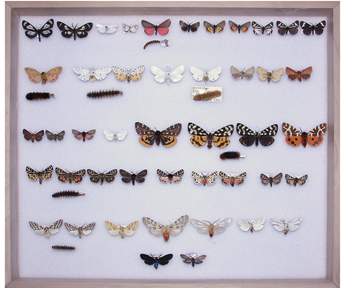
"Common Arctiid Moths of the Pacific Northwest" selected by Paul Hammond from specimens in the Oregon State Arthropod Collection (OSAC) (click to view full size image).

In connection with this, Paul Hammond prepared the drawer of common northwest arctiid moths, shown in the accompanying figure, for exhibit. The moths were not labeled, providing you with the opportunity to use the newly released PNW Moths website (discussed below) to identify them.