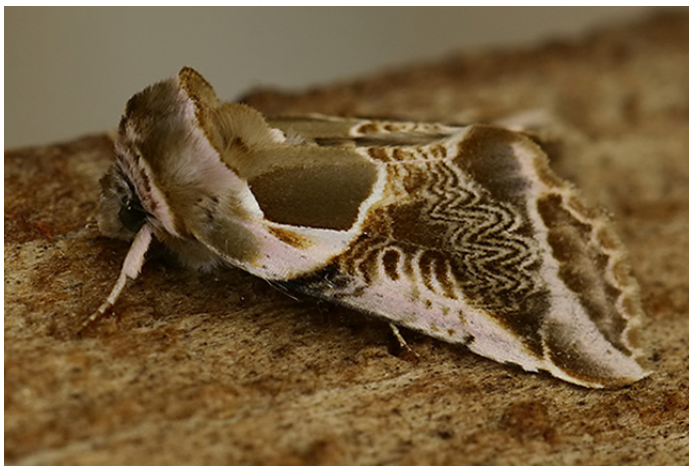
Figure 1. Habrosyne scripta —Lettered Habrosyne (USA: Oregon: Coos County: Bandon, porch light, 2006 June 18).

One point to be aware of concerns the seasonal bar graphs for each species. Each unique locality and collecting date only contributes one unit to the bar graph. The actual number of specimens col-