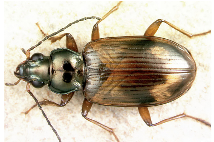
Figure 1. Bembidion transversale Dejean 1831 (~7 mm), a long-winged (+) gyrophile, one of the largest of ~98 species of Bembidion in Oregon's fauna. The species is especially common and widespread along the shorelines of rivers and lakes. Its flight wings can be seen complexly folded beneath its translucent elytra. Many subgenera of Bembidion require years of study to master their species determinations.

I have collected carabids in the Pacific Northwest (PNW = British Columbia, Washington, Idaho and Oregon) for 27 years, and cu-