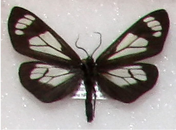
Figure 1: Unknown moth for identification (this is the same species Lars used, but this specimen was in the drawer prepared by Paul Hammond depicted above)

The identification screen is set up with four boxes. As you select features from the first box, the program will populate the other boxes. The two boxes on the right hand side show which species are still under consideration and which species have been eliminated based on the information the user has filled in to that point.