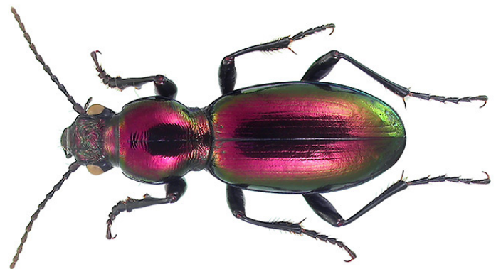
Figure 3. Zacotus matthewsii LeConte 1869 (~15 mm), a brachypterous (-) mesophile found in a wide variety of habitats from old-growth forests to dry open grasslands and farm fields. Zacotus is in the tribe Broscini, which includes three monotypic genera in the Pacific Northwest. Broscodera insignis can be found along small, rainforest streams. Miscodera arctica is a rare Pleistocene relict inhabiting dry moraine that has not yet been recorded in Oregon.

Two features of carabid beetle biology are especially fascinating—habitat specialization and variation in the development of flight wings. Habitat provides a template for the evolution of many life history features in insects, including body size and wingedness