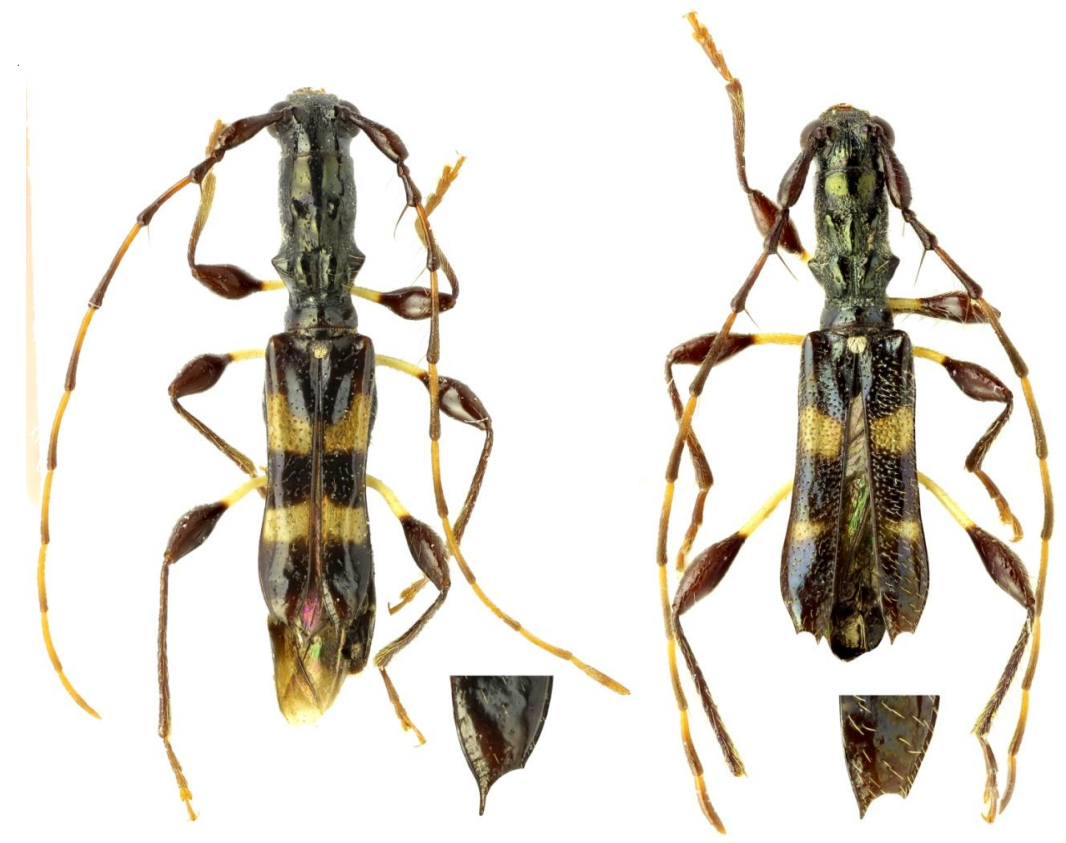
Fig. 1. Holotype of Procleomenes samarensis sp.n. A- dorsal wiev, B - apex of elytron