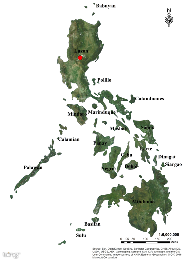
Fig. 2. Distribution map of Acronia marifelipectae sp. nov.

Differential diagnosis. New species similar to A. roseolata Breuning, 1947 (Fig. 1B), from which it differ by the following characters: 1) pronotum of A. marifelipectae sp. n. black (pronotum of A. roseolata indistinctly violet); 2) elytra of new species with two pairs of symmetrically located dorsal yellow-brown spots, scutellar spots more angular (elytra of A. roseolata without dorsal spots, scutellar spots more oval); 3) basal part of 4th antennomere with white pubescence (– basal parts of