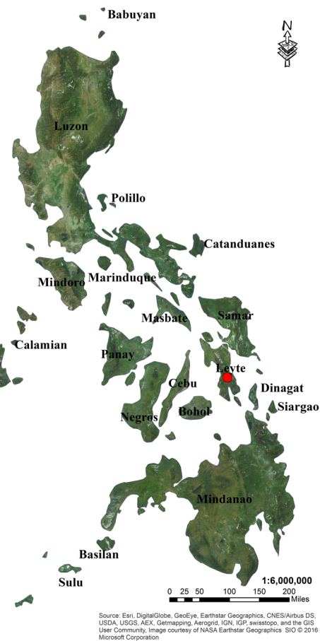
Fig. 4. Distribution map of D. lanlayroni sp. nov.