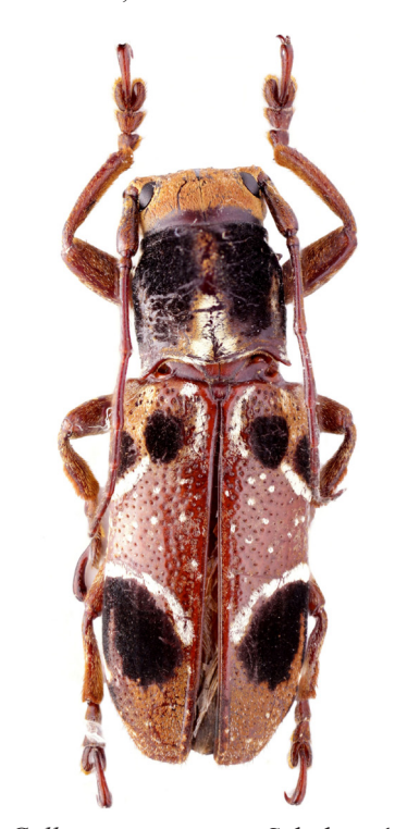
Fig. 6. Callimetopus ornatus Schultze, 1934.