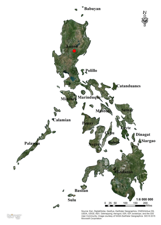
Fig. 1. Distribution map of Callimetopus danilevskyi sp. n.

Description. Body brown, with light luster and dense pubescence. Length: 15.0 mm, width: 4.9 mm.