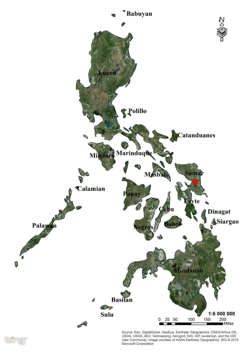
Fig. 5. Distribution map of Callimetopus ornatus Schultze, 1934.