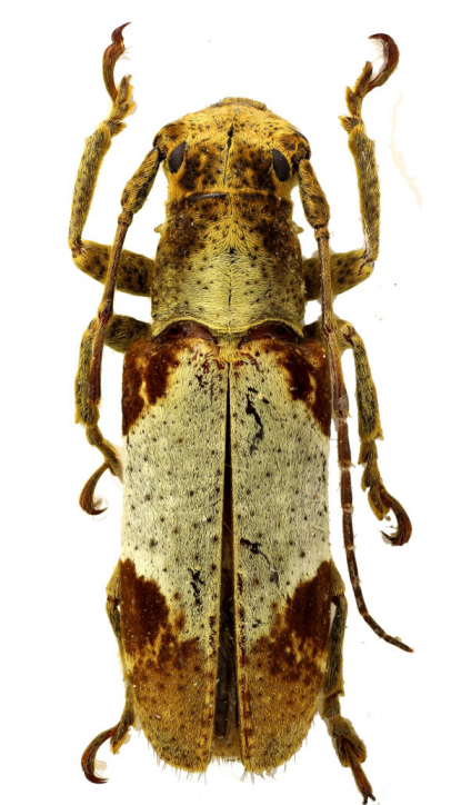
Fig. 2. Holotype of Callimetopus danilevskyi sp. n..