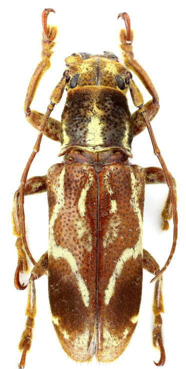
Fig. 4. Holotype of Callimetopus lazarevi sp. n..