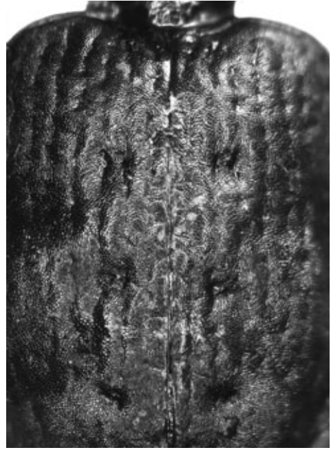
Fig. 3. Scopodes arfakensis , spec. nov. Microstructure of the elytra.

remarkably irregular around the discal foveae. Due to the strong microreticulation surface comparatively dull. Pilosity sparse, erect, very short. Marginal pores comparatively large, contrastingly coloured. Metathoracic wings very short.