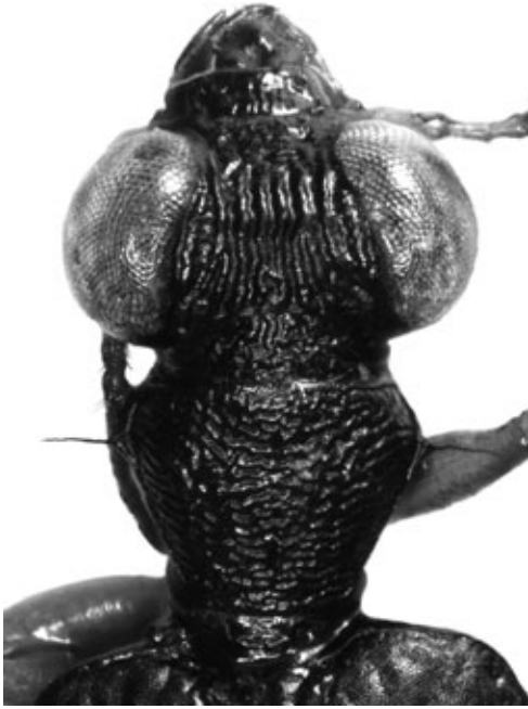
Fig. 2. Scopodes arfakensis , spec. nov. Head and pronotum.