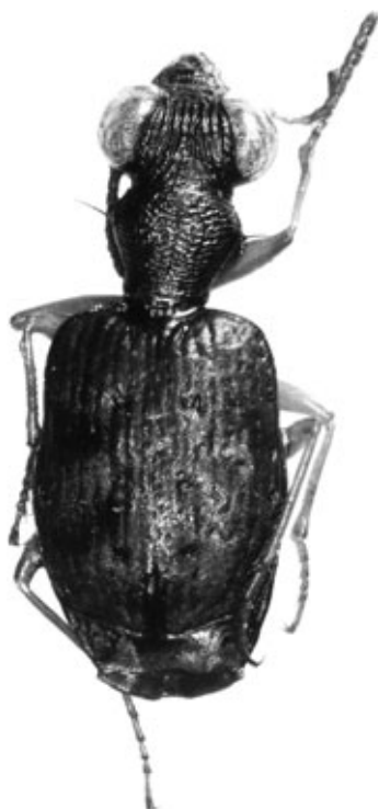
Fig. 1. Scopodes arfakensis , spec. nov. Habitus. Body length 3.5 mm.

The habitus photographs were obtained with a digital camera using ProgRes CapturePro 2.6 and Auto-Montage and subsequently digitally processed with Corel Photo Paint 11.