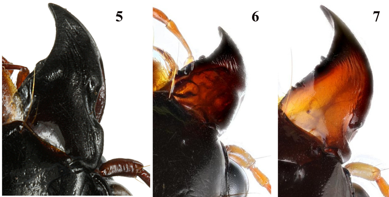
FIGURES 5–7. Acinopus . Excision of right mandible. 5, A. zagrosensis sp. n. (paratype, Sepidan), 6, A. laevigatus Mén. (source: Kirill Makarov, 2010a), 7, A. picipes (Oliv.) (source: Kirill Makarov, 2010b).

Diagnosis. A brachypterous species of small to medium size for Acinopus , with excision of dorsal edge of right mandible (subgenus Acinopus ), black (in mature condition), with appendages somewhat lighter, pronotum transverse with anterior angles somewhat acutely protruding, and with posterior angles widely rounded (habitus see Fig. 1), elytra longer cylindrical, fused at suture, hindwings reduced to small scales, metepisterna relatively short, pro- and mesotarsi in males only indistinctly widened, apical lamella of median lobe short, about somewhat elongate-triangular (dorsal view).