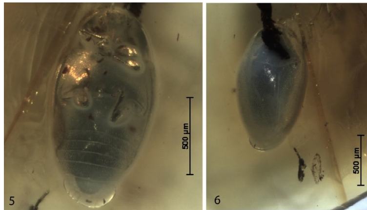
Figures 5-6. Corylophinae. Specimen No 1303-2 [CCHH]. Habitus: 1 - Ventral view; 2 - Dorsal view.

subtriangular; apical segment of the club oval, broad and rounded apically. Ratio of antennomere lengths: 5.0: 5.0: 2.0: 1.0: 1.0: 1.0: 2.0: 1.0: 4.0: 4.0: 5.0.