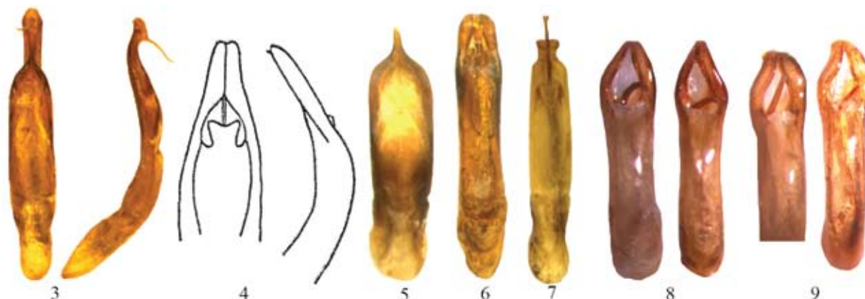
Figures 3–9. Aedeagus: 3 – G. decemnotata , 4 – G. flavicornis (after Bieńkowski 2004), 5 – G. linnaeana , 6 – G. pallida , 7 – G. viminalis , 8 – G. quinquepunctata , 9 – G. intermedia .