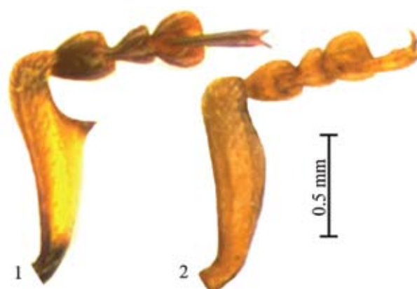
Figures 1–2. Fore tibiae: 1 – G. linnaeana , 2 – G. quinquepunctata .

Examined material: 13 specimens: Aizkraukle d.: Aiz-