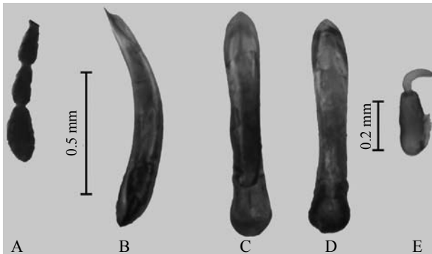
Figure 1. Chaetocnema concinna (Marsham, 1802): 9 th –11 th antennomeres (A), aedeagus in lateral (B), dorsal (C) and ventral (D) aspects, spermatheca (E).