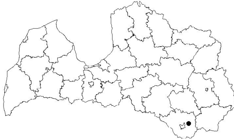
Fig. 1. Localition of Hermaeophaga mercurialis (F.) record from Naujene, Latvia.