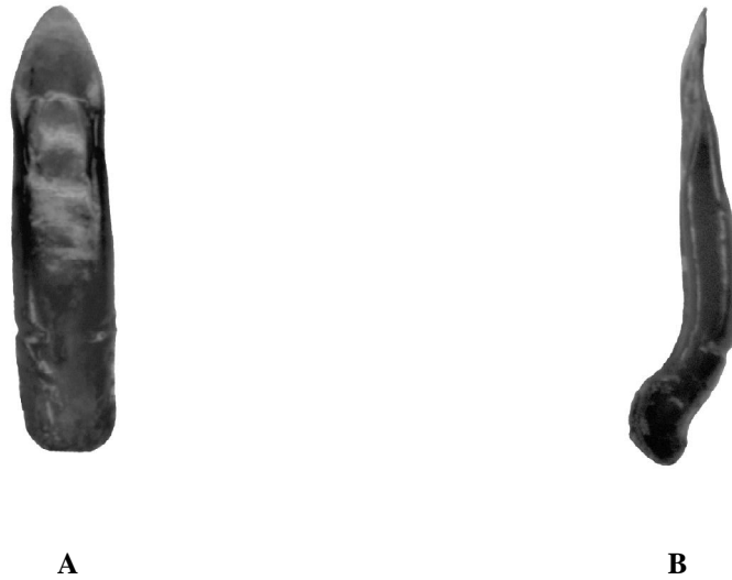
Fig. 3. Hermaeophaga mercurialis (F.) aedeagus in dorsal (A) and lateral (B) aspects.