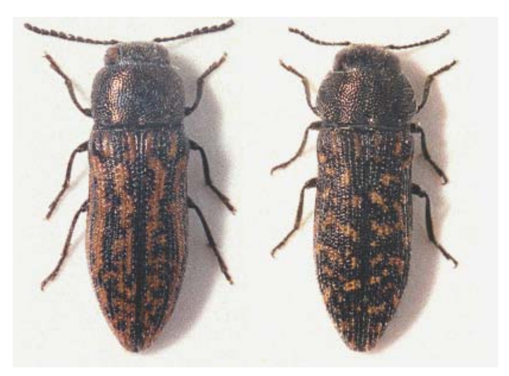
Fig. 1. Acmaeodera (Acmaeotethya) guayarmina sp.n., habitus. Fig. 2. Acmaeodera (Acmaeotethya) cisti Woll., habitus.

in the middle. Head densely punctured, punctures fine and simple without inner structures, intervals smooth, shining; covered with a short, fine, white, directed forward or decumbent pubescence. Antennae long, 2.29 (2.12-2.41) x (male) or 1.84 (1.75-1.94) x (female) as long as the height of an eye; expanded from antennomere 4; antennomere 2 lengthened, feebly expanded; antennomere 3 similar to 2, apically thickened; antennomere 4 strongly expanded apically, triangular; antennomeres 5-10 triangular with external margin arcuate, slightly wider than long; antennomere 11 slender with the apex obliquely truncate.