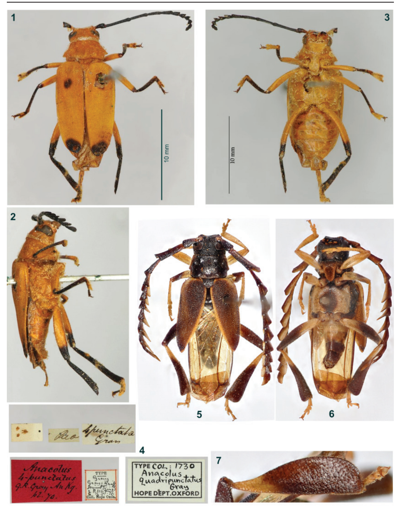
Figures 1–7. Anacolini spp. 1–4) Anacolus quadripunctatus, Lectotype female: 1) Dorsal habitus. 2) Lateral habitus. 3) Ventral habitus. 4) Labels. 5–7) Myzomorphus gounellei, male, specimen from MNRJ: 5) Dorsal habitus. 6) Ventral habitus. 7) Metatibia, lateral view.