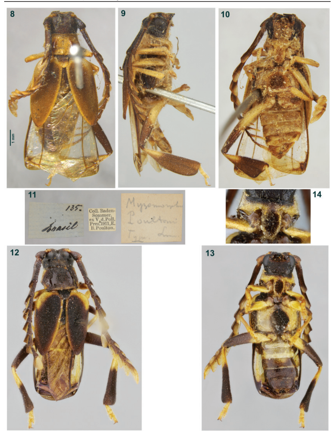
Figures 8–14. Myzomorphus spp. 8–11) Myzomorphus poultoni , holotype male: 8) Dorsal habitus. 9) Lateral habitus. 10) Ventral habitus. 11) Labels. 12–14) Myzomorphus poultoni , male, specimen from MNRJ: 12) Dorsal habitus. 13) Ventral habitus. 14) Prosternal process.