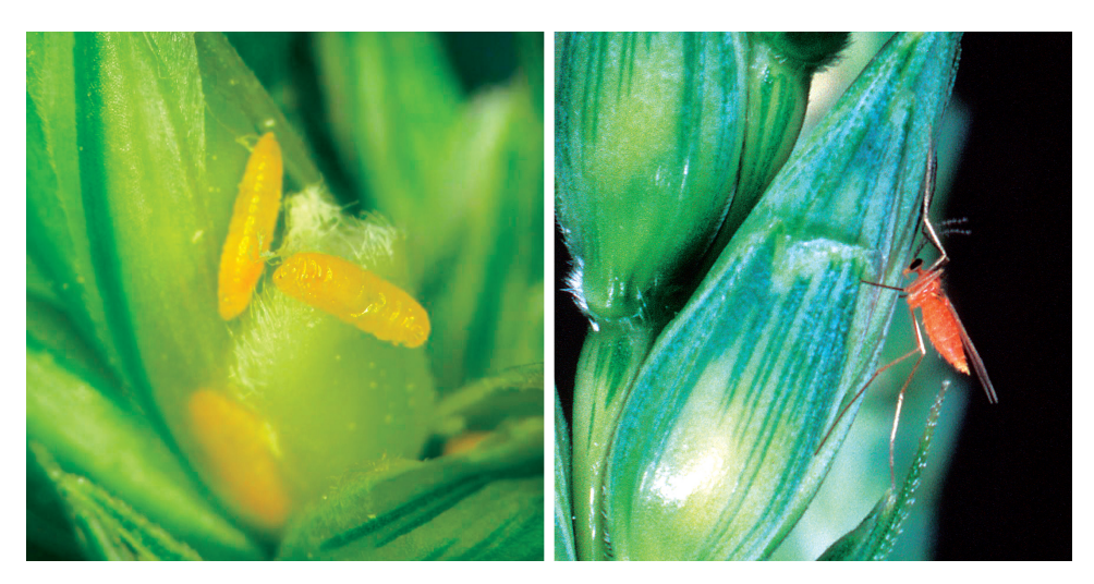
Fig. 6. Wheat midge larvae, Cereal Research Centre, Fig. 7. Wheat midge adult, Cereal Research Centre, Winnipeg, Manitoba.