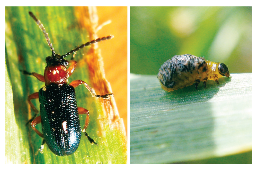
Fig. 3. Cereal leaf beetle, Oulema melanopus, adult.Fig. 4. Cereal leaf beetle, Oulema melanopus, larva.Photo by J. Gavloski.Photo by J. Gavloski.

can also eat through the sheath above the upper node, severing the stems and turning the heads of wheat white (Beirne 1971). Billbugs usually overwinter as adults (Metcalf et al. 1951) and may be more common in low-lying, wet sites (Buntin et al. 2007).