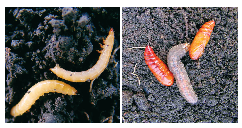
Fig. 1. Wireworms from wheat field. Photo by J. Gavloski. Fig. 2. Redbacked cutworm, Euxoa ochrogaster , larva and pupae. Photo by J. Gavloski.

cutworm, Euxoa auxiliaris (Grote), being common in cereal crops in the western parts of the Canadian prairies (Byers and Struble 1987). All three species have univoltine life cycles, although they differ in specific life cycle details.