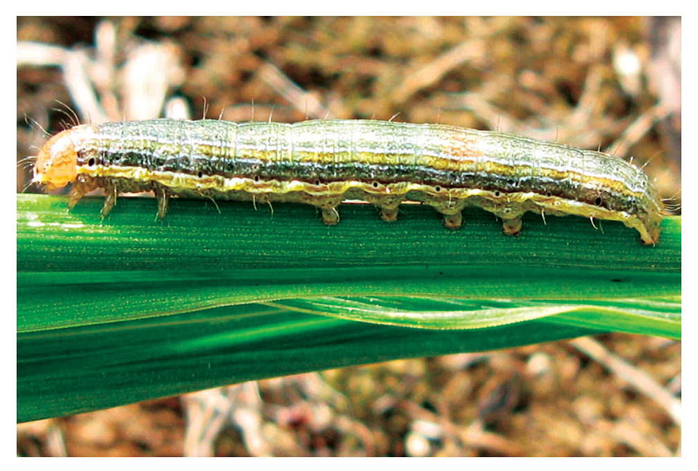
Fig. 5. Armyworm, Mythimna unipuncta, on oats.

Larvae are tan or green caterpillars with lateral white, gray, green, or brown stripes. Larvae feed on above-ground plant regions, causing some defoliation, and may also feed on maturing grain heads and chew directly into the developing kernels. They drop to the ground and pupate by harvest time (Buntin et al. 2007). High populations of this insect are infrequent (Beirne 1971).