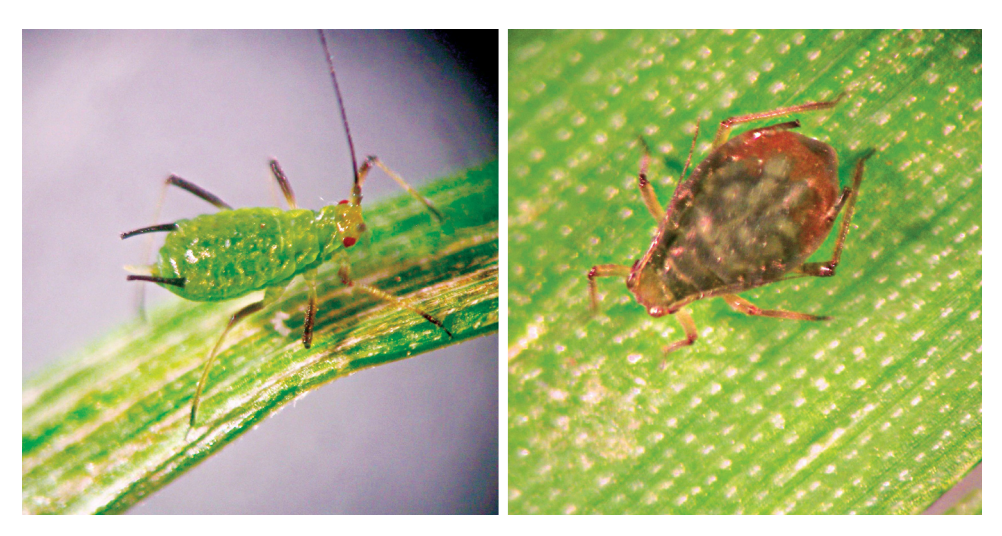
Fig. 11. English grain aphid, Sitobion avenae, on oats.Fig. 12. Oat-birdcherry aphid, Rhopalosiphum padi, onPhoto by J. Gavloski.oats. Photo by J. Gavloski.

The rye jointworm, Harmolita secale (Fitch), caused economic damage to rye in Alberta in 1968, 1969, and 1970 (Holmes and Blakeley 1971). Infested stems reached an average of 21 galls, mainly in the second to fourth internodes.