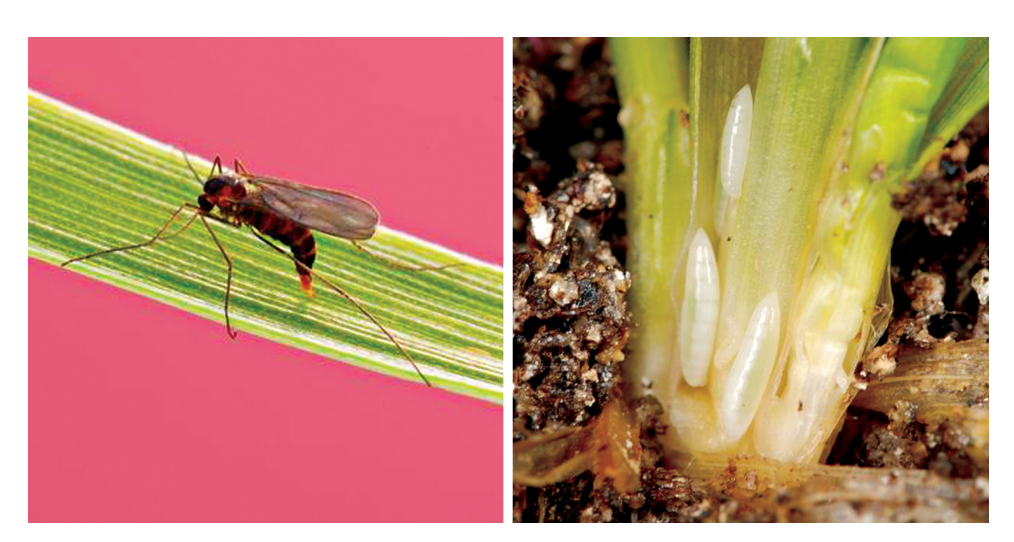
Fig. 8. Hessian fly ovipositing, Cereal Research Centre, Fig. 9. Larvae of Hessian fly, Cereal Research Centre, Winnipeg, Manitoba.