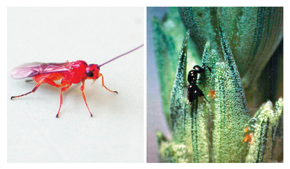
Fig. 13. Bracon cephi.

Bracon cephi Gahan (Braconidae). Bracon cephi (Fig. 13) is an idiobiont ectoparasitoid of the wheat stem sawfly (Cephus cinctus) (Runyon et al. 2001). It is the only parasitoid found in significant numbers with this sawfly in the Canadian prairies (Holmes et al. 1963). Many other parasitoids of wheat stem sawfly are either from perennial grasses or are not common in annual crops (Morrill 1997). Bracon cephi is bivoltine, overwintering as a larva in a cocoon inside the stem where it parasitizes the sawfly larva (Holmes et al. 1963). Firstgeneration adults emerge in late June to early July at about the same time as the wheat stem sawfly, and oviposition generally starts three weeks later. The female wasp stings the sawfly larva, paralyzing it, and then lays an egg on the larva or nearby. The Bracon cephi larva then consumes the sawfly larva, spins a cocoon, and pupates. Second-generation adults usually appear in mid-August and immediately start to oviposit. Parasitism occurs until freezing temperatures kill the adults. The second generation is often reduced when harvest is early (Holmes et al. 1963). Bracon cephi are capable of terminating sawfly outbreaks in localized areas (Holmes et al. 1963). A related species, Bracon lissogaster Muesebeck, has not been reported from the Canadian prairies, although it is a common parasitoid of wheat stem sawfly in Montana (Morrill 1997).