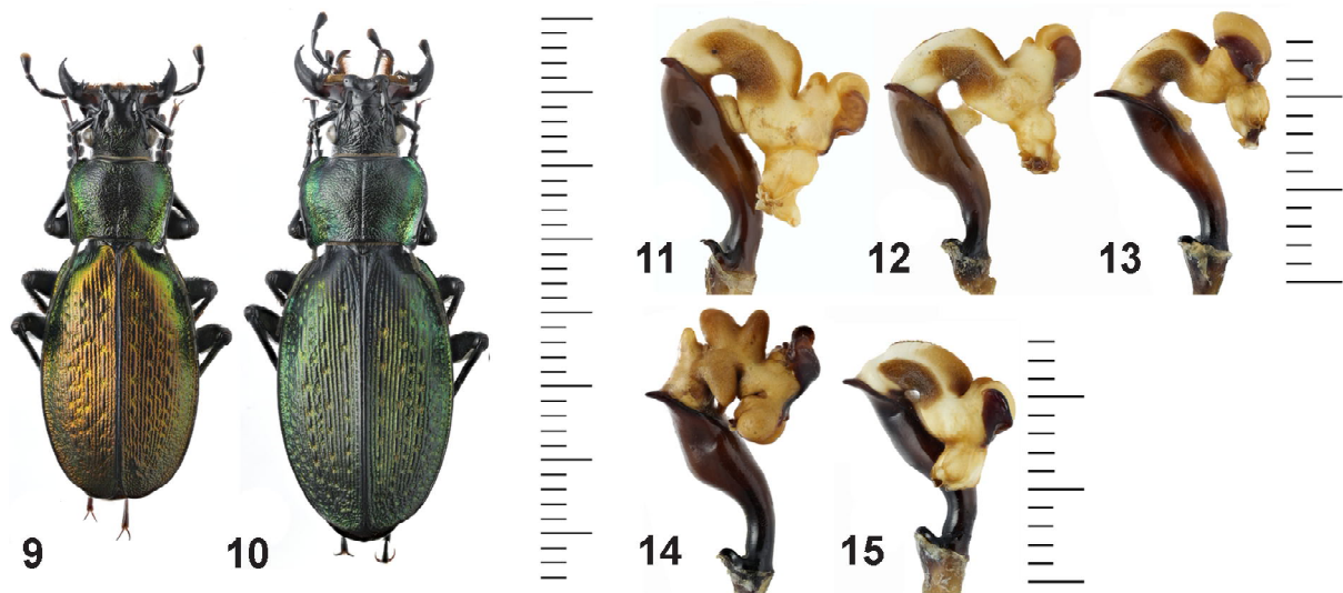
Figs 9–15. Carabus (Neoplectes) mellyi , dorsal habitus, Georgia, Lechkhumi Mt. Range near Orbeli vill. (9–10), Carabus (Neoplectes) spp., aedeagus and fully inflated endophallus preparation (11–15). 11 — C. (N.) ibericus lafertei , Georgia, Adzharia-Imereti Mt. Range near Abastumani vill.; 12 — C. (N.) szekelyii , Georgia, Racha Mt. Range near Nakerala Pass; 13 — C. (N.) titarenkoi sp.n., paratype, Georgia, N slopes of Mt. Khvamli; 14 — C. (Neoplectes) mellyi , Georgia, Lechkhumi Mt. Range near Orbeli vill.; 15 — C. (N.) ibericus ibericus (=imereticus) , Georgia, Surami Mt. Range near Rikoti Pass. Scale bars are given in mm.

Рис. 9–15. Carabus (Neoplectes) mellyi , общий вид, Грузия, Лечхумский хр. у с. Орбели (9–10), Carabus (Neoplectes) spp., препарат эдеагуса и полностью раздутого эндофаллуса (11–15). 11 — C. (N.) ibericus lafertei , Грузия, Аджаро-Имеретинский хр. у с. Абастумани; 12 — C. (N.) szekelyii , Грузия, Рачинский хр. у пер. Накерала; 13 — C. (N.) titarenkoi sp.n., паратип, Грузия, сев. склоны г. Хвамли; 14 — C. (Neoplectes) mellyi , Грузия, Лечхумский хр. у с. Орбели; 15 — C. (N.) ibericus ibericus (=imereticus) , Грузия, Сурамский хр. у Рикотского пер. Масштабные линейки даны в мм.