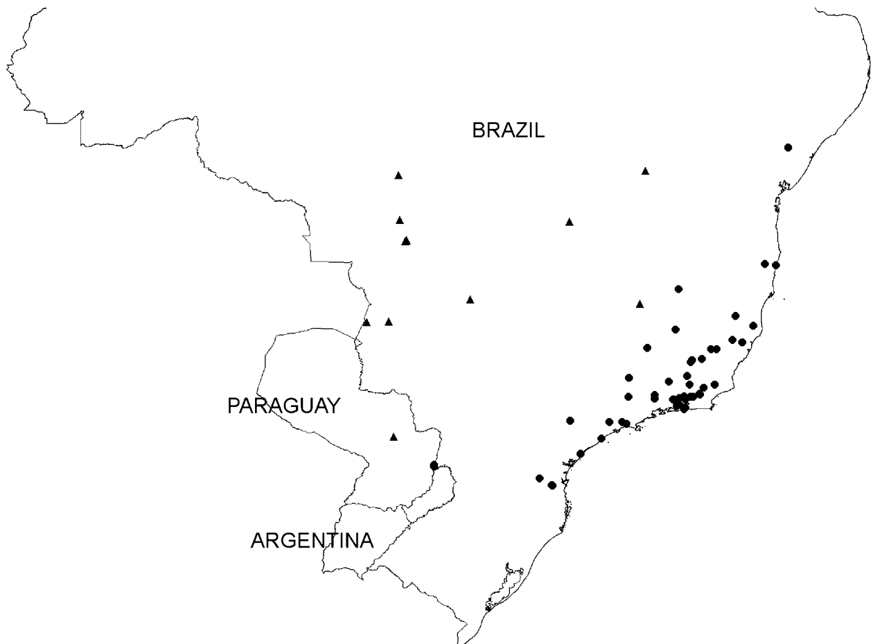
FIGURE 10. Known distribution of C. hesperus (●) and C. inexpectatus (▲) in South America.

Paratypes (all with FZVM yellow paratype labels): BRAZIL: Bahia: Barreiras, XII-1991 (1 ♀ CEMT); Goiás: Mineiros, PNEmas, 17°59'48"S, 52°56'54"W, 837 mosl, Light trap, 15-III-2011, M.F. Souza (1 ♂ CEMT); Niquelândia, X-1994 (1 unsexed CEMT); Mato Grosso: Chapada dos Guimarães, PNCG Módulo, 15°19'51"S, 55°51'9"W, 14.XII.2012, GM Daniel, pitfall (1 unsexed CEMT); same but 15°19'53"S, 55°51'10"W (1 unsexed CEMT); same but 15°19'31"S, 55°51'30"W (1 unsexed CEMT); Diamantino, Vale da Solidão, 14°22'14"S, 56°07'59"W, 21-X-2000, Luminosa, E. Furtado Casa (1 ♂ CEMT); [Japurah] Faz. São Tiago, 12.35 S, 56.20 W, XI-1982 (1 ♀, CEMT); Mato Grosso do Sul: Corumbá, 20-XI-1992, Faz. Nhumirim-Embrapa, Pantanal, 18°59'S, 56°39'W, Ex. Armadilha Luminosa, A.T.M Barros col. (1 ♂ CEMT); Corumbá, Centro de pesquisa EMBRAPA, Pantanal, 26-X-1992, A.T. Barros col. (1 ♀ CEMT); Minas Gerais: Três Marias, X-1989, J.C. Zanuncio (1 ♂, 2 ♀ CEMT); same but I-1993 (1 unsexed CEMT); PARAGUAY: Paraguari: Jaguarón, Santa Clara (1 ♀ MNHN).