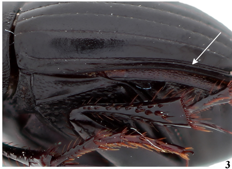
FIGURES 1–3. Genus Chalcocopris . 1. Dorsal habitus of C. hesperus (male). 2. Dorsal habitus of C. inexpectatus sp. n. (male) 3. Left elytron of C. inexpectatus , arrow points to interstitial carina.