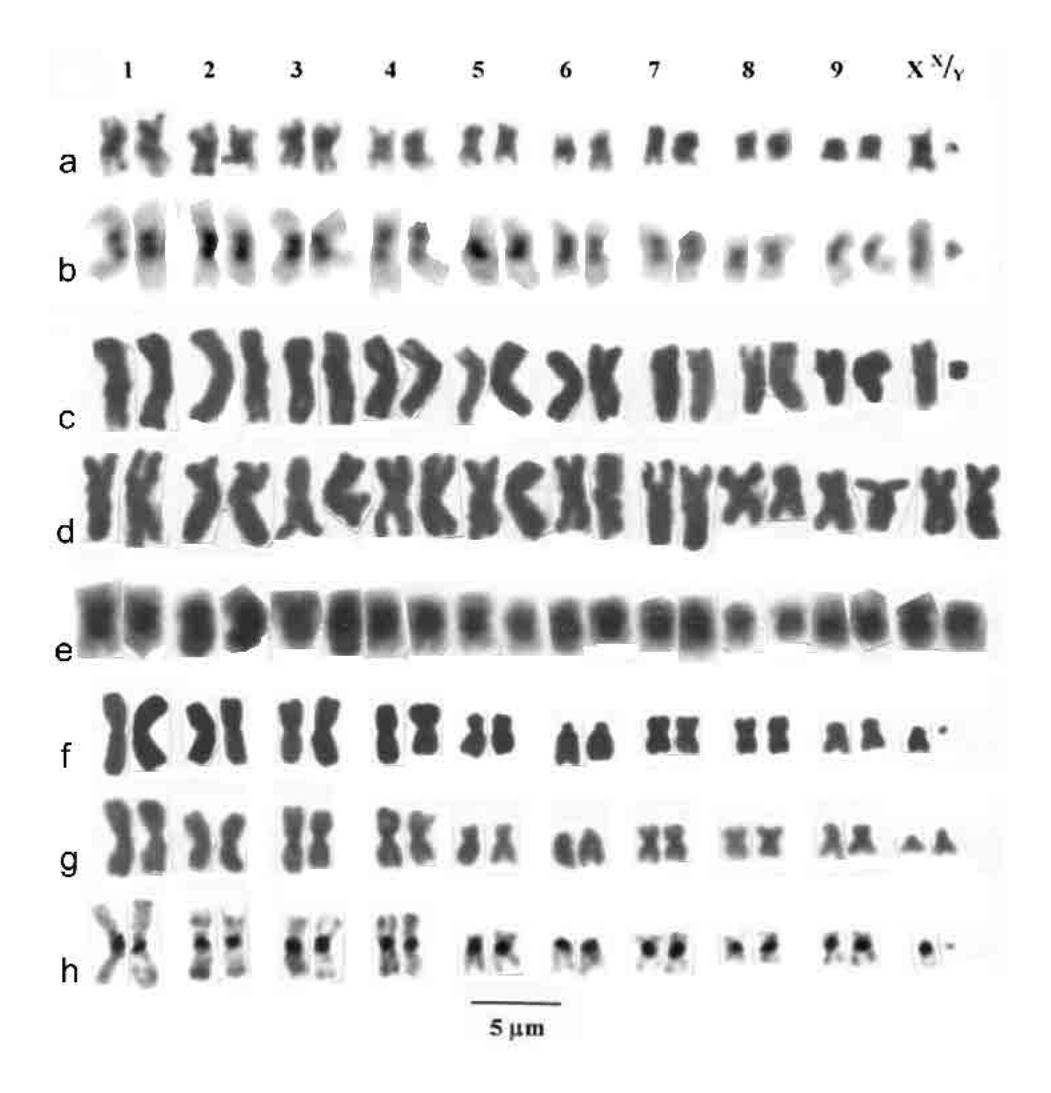
Fig. 3: Mitotic chromosomes from mid-gut cells of Chilothorax species; a , b : A . lineolatus , Tarifa, \sigma , the same specimen, a plain, b C-banded; c - e : A . paykulli , Box Hill, c \sigma , plain, d \varphi , plain, e \varphi , C-banded; f - h : A . sticticus , f \sigma , Ilfracombe, plain, g \varphi , Chalfont St Giles, plain, h \sigma , Martyr's Green, C-banded.

Aphodius rufipes. Fig. 1g, h. Published information: 2N = 20 ( \Im ), 9 bivalents + Xy (VIRKKI 1951). 2N = 18 + Xy. The autosomes range in RCL from about 14 to 7, and the X chromosome is about as long as autosome 4, RCL about 10.5. Autosomes 1 - 6 and 8 are submetacentric, while autosomes 7 and 9, and the X chromosome, are metacentric. The male karyotype (Fig. 1g) is partly C-banded and shows distinct centromeric C-bands similar in size to those of A. luridus . The long arms of autosomes 1 and 2, and the short arm of autosome 5, show distinct secondary constrictions, which in this preparation appear as gaps rather than C-bands.