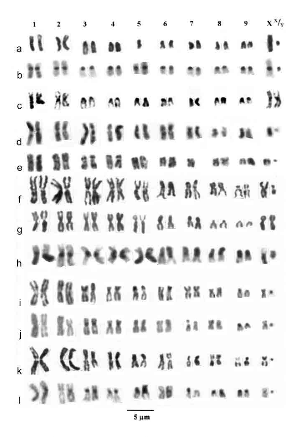
Fig. 2: Mitotic chromosomes from mid-gut cells of Nimbus and Chilothorax species; a - c : A. contaminatus , East Hendred, a \mathcal{J} , plain, b \mathcal{J} , C-banded, c \varphi , plain; d , e : A. obliteratus , \mathcal{J} , d Betteshanger, plain, e Martyr's Green, partially C-banded, one replicate of autosome 7 missing; f - h : A. conspurcatus , New Forest, f \mathcal{J} , plain, g \varphi , plain, h \mathcal{J} , C-banded; i - l : A. distinctus , i , j , \mathcal{J} , Cothill, i plain, j C-banded, k , l , Gayton Thorpe, \mathcal{J} , the same specimen, k plain, l C-banded.