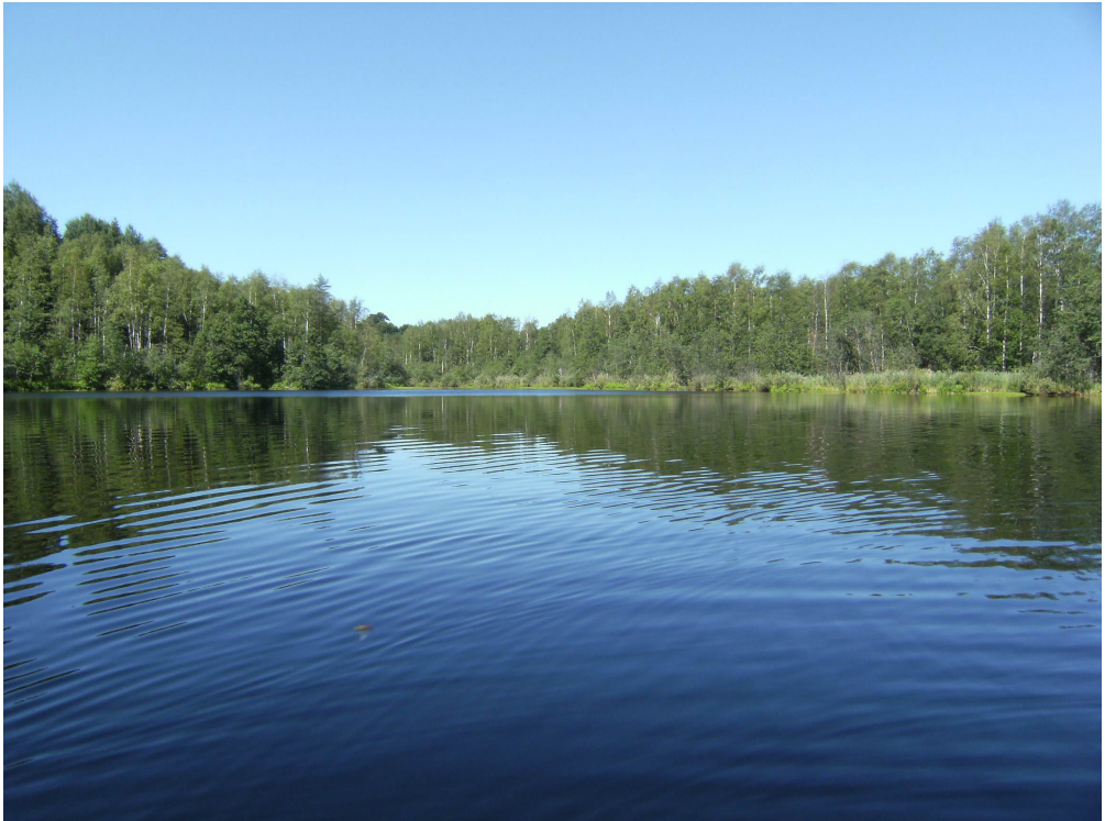
Figure 1. Lake Glukhoye in Tver Oblast, European Russia, used as a model waterbody for studying funnel trap efficiency, photographed in July 2010.

volume was filled with water and the rest of the volume (close to the bottom) was filled with air and protruded above the surface. We put 10 g of meat fibres (without fat) of tinned Glavprodukt stewed beef (GOST 5284-84) in one bottle in each pair and 10 g of frozen liver in the other. Each portion of bait was weighed using electronic scales.