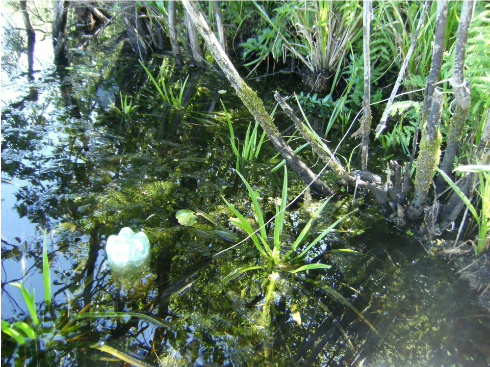
Figure 2. Funnel trap set near lake bank and fastened to a shrub by cord (Lake Glukhoye, July 2010).