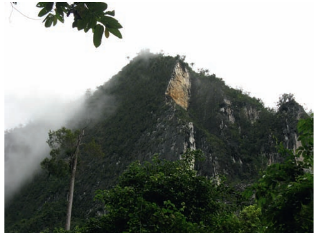
Figure 2. West Papua, Triton Bay, Lobo village, valley stream on Mt. Lecyansir.