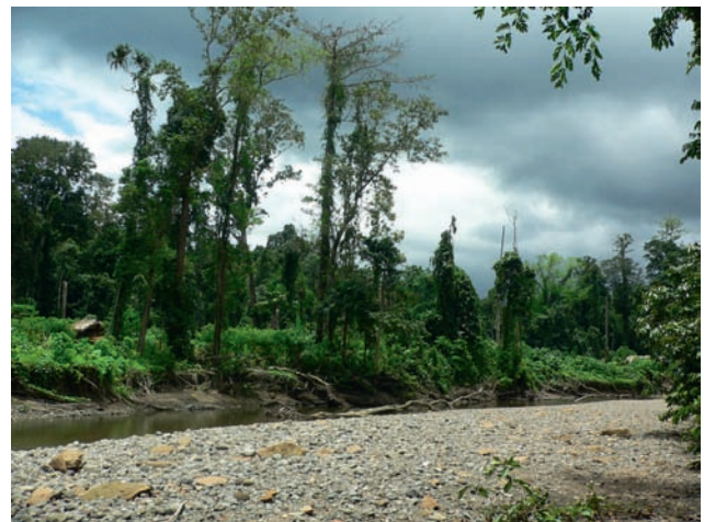
Figure 6. Riverside clearing & garden surrounded by primeval rainforest of Benteng Ridge, South Halmahera, is an ideal spot for observing Acalolepta.