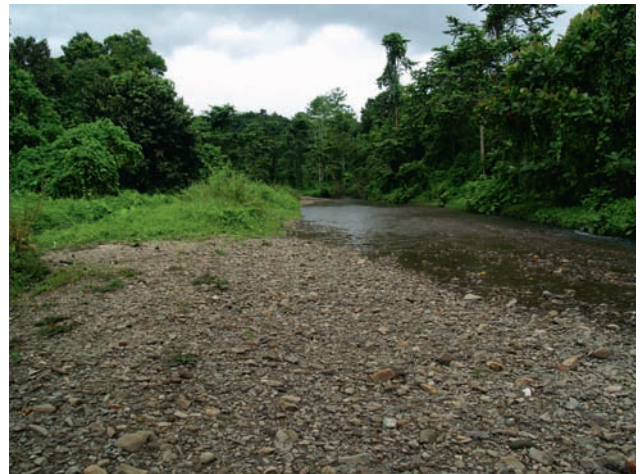
Figure 4. Acalolepta collecting locality in riverbed in Central Seram.