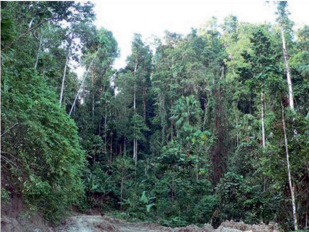
Figure 1. Primeval lowland rainforest in Oham area with new road under construction, South Halmahera.

VITALI F.: Notes on the genus Acalolepta Pascoe, 1858 from Indonesian Papua and the Moluccas