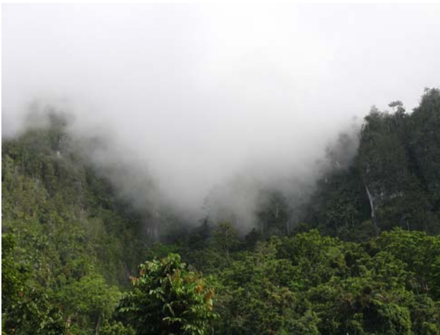
Figure 3. Midday fog moving from Mt. Lecyansir down to Lobo village, Triton Bay.