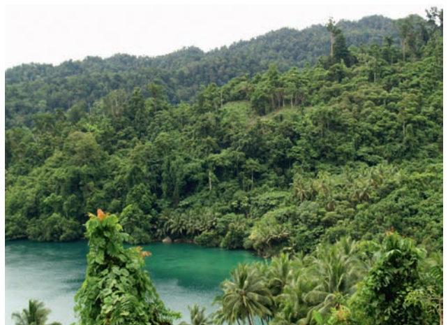
Figure 6. Small gardens and clearings around Warika village in Triton Bay, from where several Acalolepta specimens were recorded.