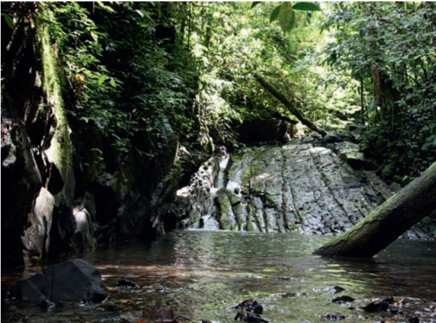
Figure 1. Primeval lowland dipterocarp rainforest in Hakau River valley near Aduway village, Misool.

VITALI F.: Notes on the genus Acalolepta Pascoe, 1858 from Indonesian Papua and the Moluccas