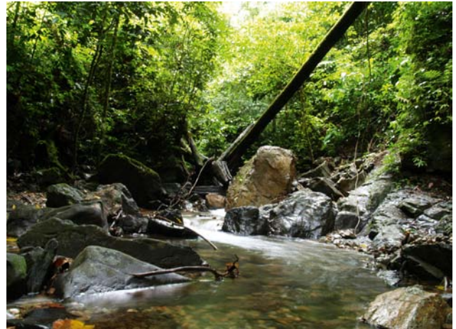
Figure 2. Acalolepta specimens were observed on green riverside vegetation in Hakau River valley, Misool.