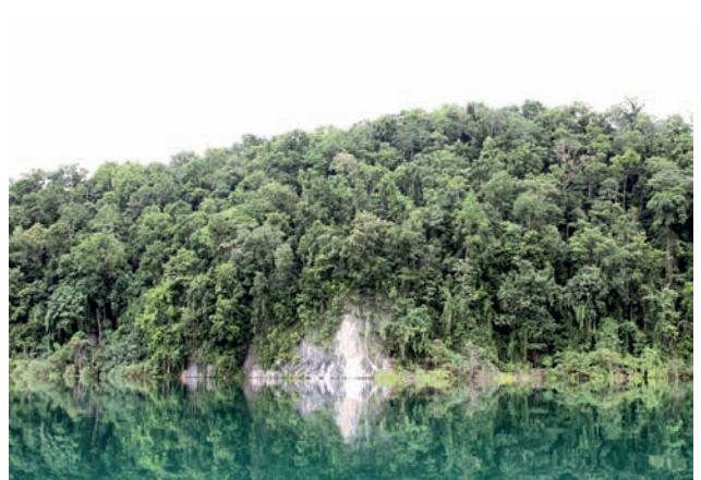
Figure 2. Several Acalolepta specimens observed near Lake Kamakawalar on southern Bird's Neck of Indonesian Papua.