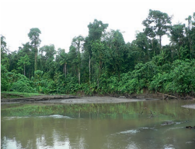
Figure 5. Primeval lowland dipterocarp rainforest on Benteng Ridge, South Halmahera.