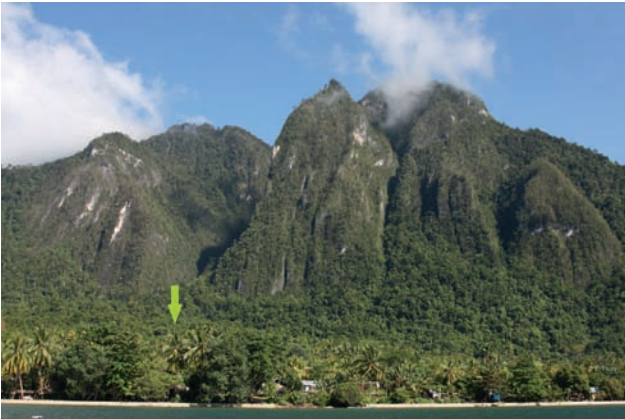
Figure 1. West Papua, Triton Bay, panoramic view of Lobo village with Mt. Lecyansir in background. Green arrow indicates sampling site.

VITALI F.: Notes on the genus Acalolepta Pascoe, 1858 from Indonesian Papua and the Moluccas