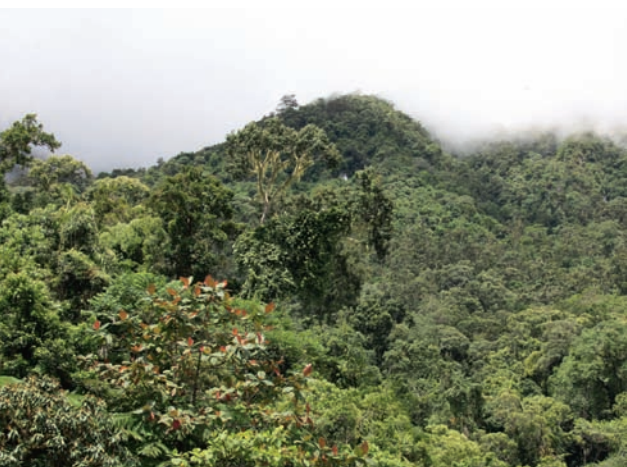
Figure 5. Midday rain cloud is moving down from Manusela Ridge in Central Seram (photo: D.Telnov).