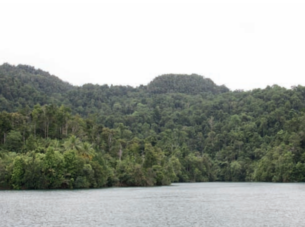
Figure 5. Coastal view in Triton Bay near Warika village in southern Bird's Neck, Indonesian Papua.