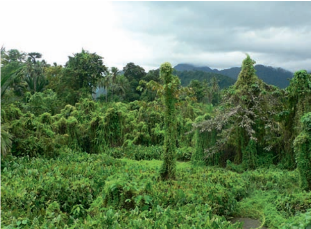
Figure 3. Lower bog near Horale village on north coast of Seram (photo: D.Telnov).