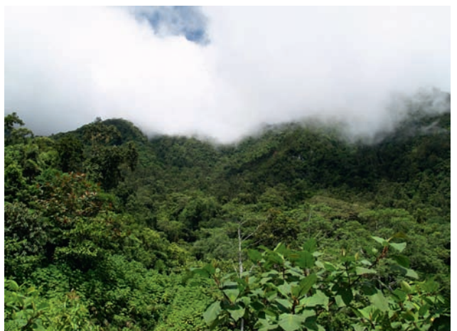
Figure 6. Sampling spot for Acalolepta in primeval rainforests of Manusela Ridge, Central Seram.