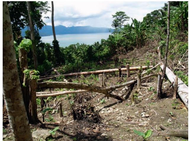
Figure 4. Small recent clearing established for a garden in primeval lowland rainforest in River Lengguru valley near Lobo.