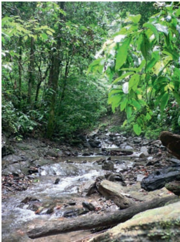
Figure 3. Primeval lowland dipterocarp rainforest in Hakau River valley near Aduway village, Misool, where Acalolepta specimens were observed.