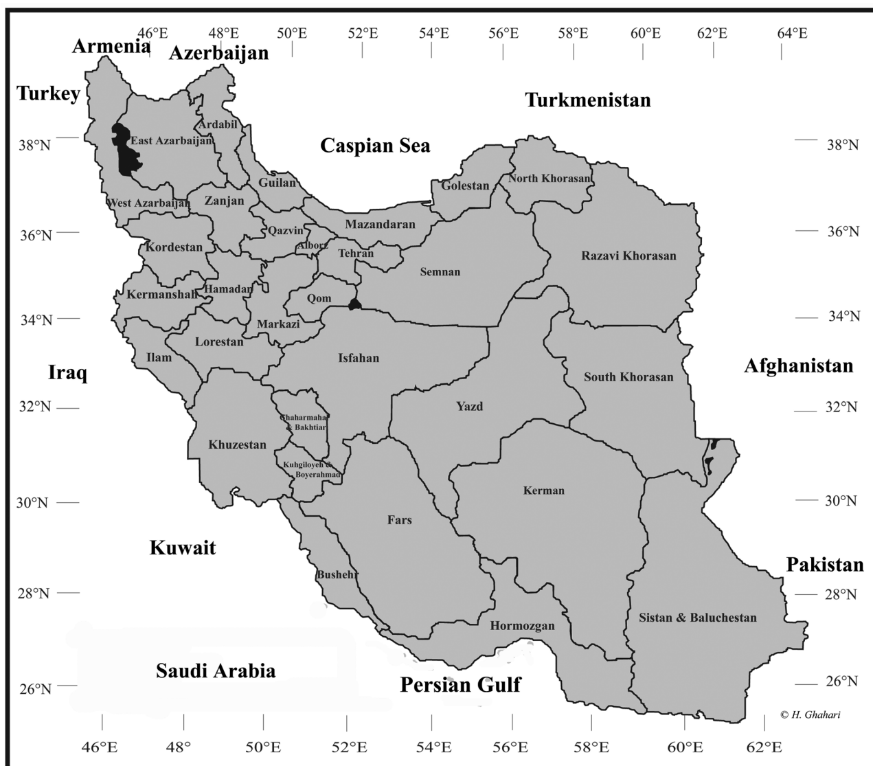
FIGURE 1. Map of Iran with boundaries of provinces.

This paper which its aim is cataloging of all the data on Iranian Myxophaga and Adephaga (excluding Carabidae and Dytiscidae), is a continuation of the series of checklists of Iranian aquatic Coleoptera (Mascagni et al. 2016; Jäch et al. 2016).