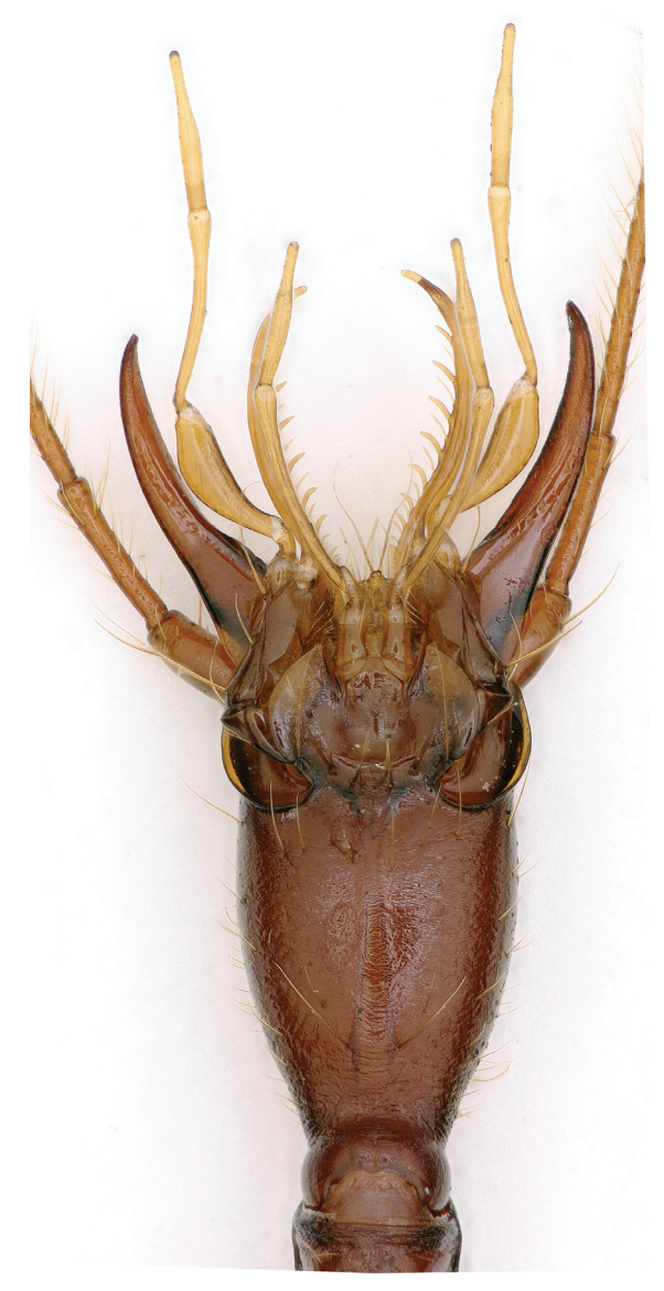
Figure 2. Head (ventral) of Xuedytes bellus , a paratype female.

PrL/PrW = 2.94–2.95, slightly wider than head, PrW/HW = 1.18–1.19, evidently wider than pronotum, PrW/PnW = 1.27–1.30. Pronotum very strongly elongated, tube-like in front half which is narrow and nearly parallel-sided; convex at about basal 1/5 where the widest point lies, then gently sinuate before hind angles which are obtuse and rectangular, fore angles rounded; nearly four times longer than wide, PnL/PnW = 3.84, slightly narrower than head, PnW/HW = 0.91–0.92, base slightly concave, wider than front, PbW/PfW = 1.27, front convex; lateral sides finely bordered throughout, base and front unbordered;