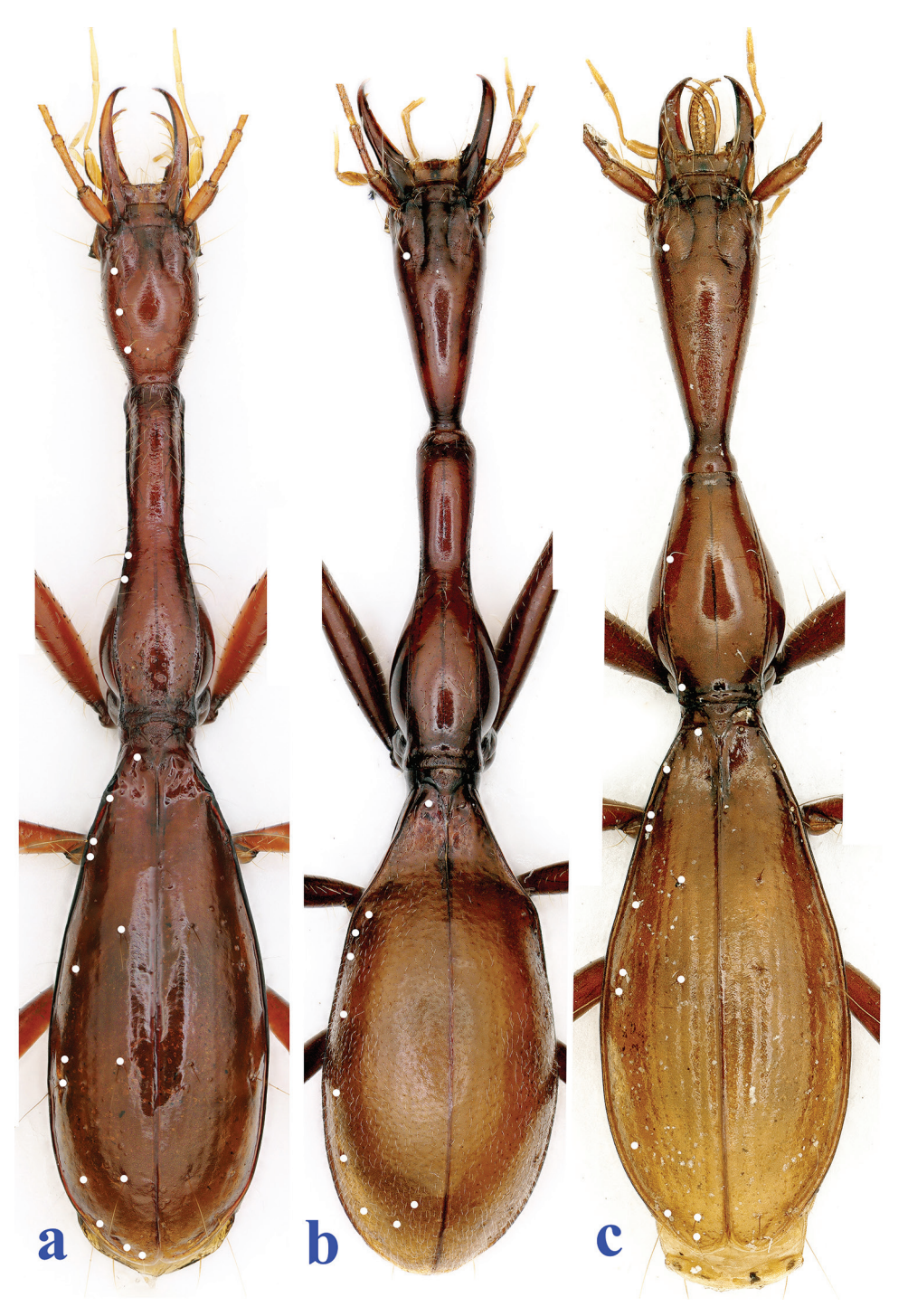
Figure 3. Habitus of three highly modified aphaenopsian beetles (chaetotaxy indicated by white points) a Xuedytes bellus , holotype male b Giraffaphaenops clarkei Deuve, 2002, male c Dongodytes grandis Uéno, 1998, male.