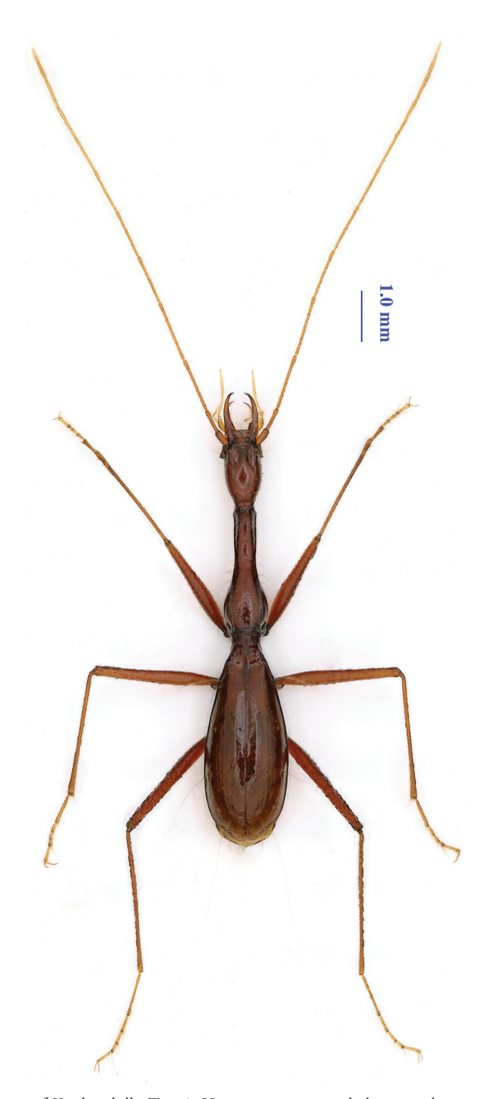
Figure 1. Habitus of Xuedytes bellus Tian & Huang, gen. et sp. n., holotype male.