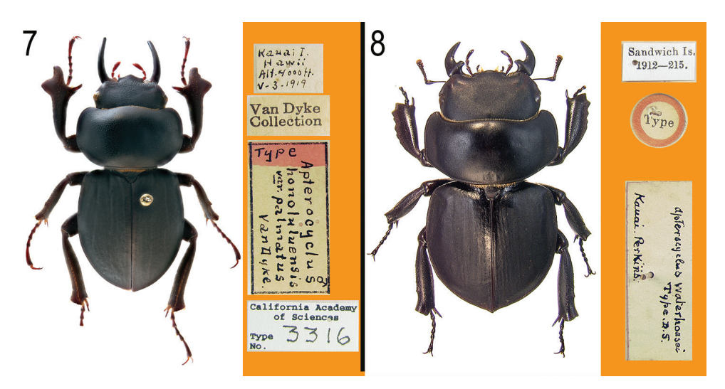
Figures 7-8. Primary types of Apterocyclus species. 7 Apterocyclus palmatus Van Dyke, holotype 8 A. waterhousei Sharp, holotype.

Distribution. Specimens have been examined from Kohua/Mohiki [Mohihi?] Stream, Kaholuamano, and near Waialae River (BPBM). Mizunuma (2000) illustrated