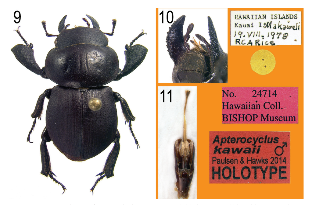
Figures 9–11.9 Holotype of Apterocyclus kawaii , sp. n., with labels. 10 Mandibles, oblique ventral view showing tubercles 11 Male genitalia.