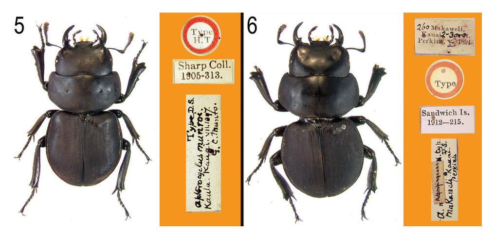
Figures 5–6. Primary types of Apterocyclus munroi and its synonyms, with labels. 5 A. munroi Sharp, lectotype 6 A. adpropinquans Sharp, holotype.