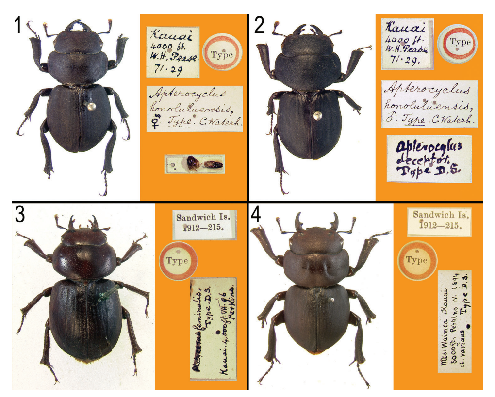
Figures 1–4. Primary types of Apterocyclus honoluluensis and its synonyms, with labels. 1 A. honoluluensis Waterhouse, lectotype 2 A. deceptor Sharp, holotype 3 A. feminalis Sharp, holotype 4 A. varians Sharp, holotype.

of A. honoluluensis (Fig. 1). We designate that specimen here as the lectotype of A. honoluluensis , in agreement with ICZN recommendation 74B. The other specimen becomes a paralectotype of A. honoluluensis , and it also is the holotype of A. deceptor Sharp (Fig. 2). The holotypes of A. deceptor , A. feminalis (Fig. 3), and A. varians (Fig. 4) are conspecific with A. honoluluensis , and these synonymies proposed by Van Dyke (1922) are reconfirmed.