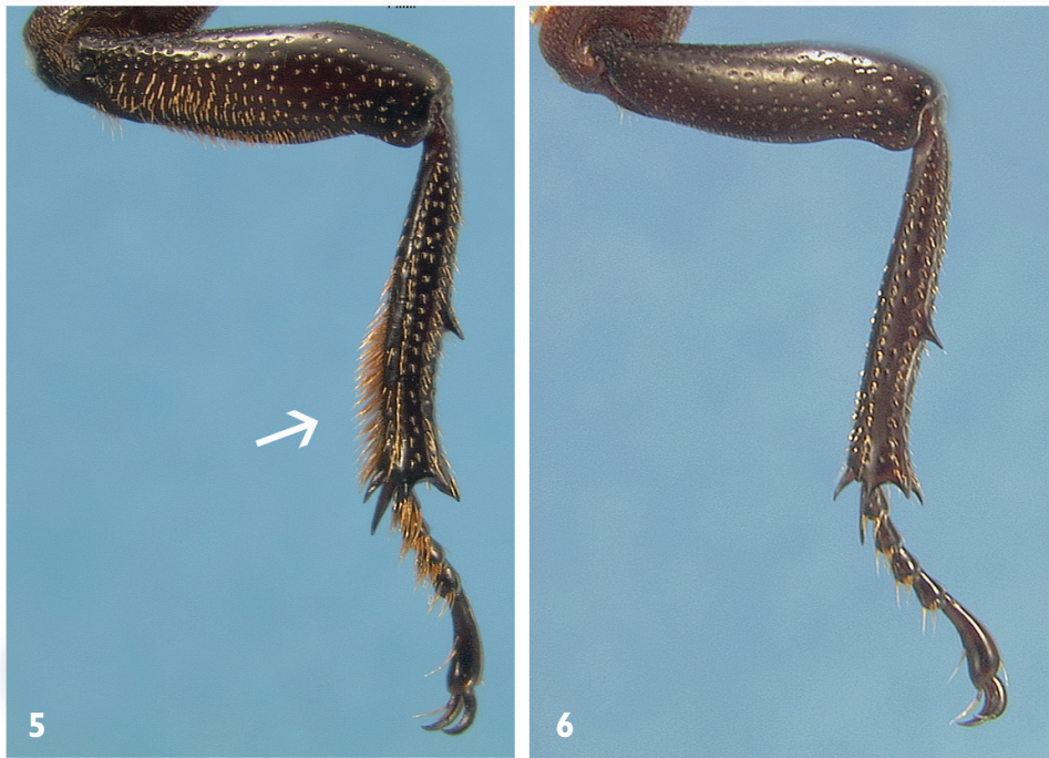
Figures 5–6. Left metatibia of males, ventral view. 5 Dorcus parallelus , arrow pointing to dense field of setae 6 Dorcus brevis .