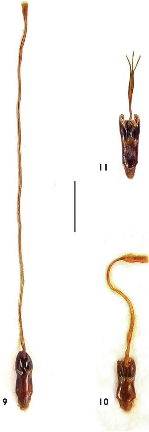
Figures 9–11. Male genitalia (parameres and flagellum). 9 Dorcus parallelus 10 Dorcus brevis 11 Dorcus parallepipedus . Scale bar = 5 mm.