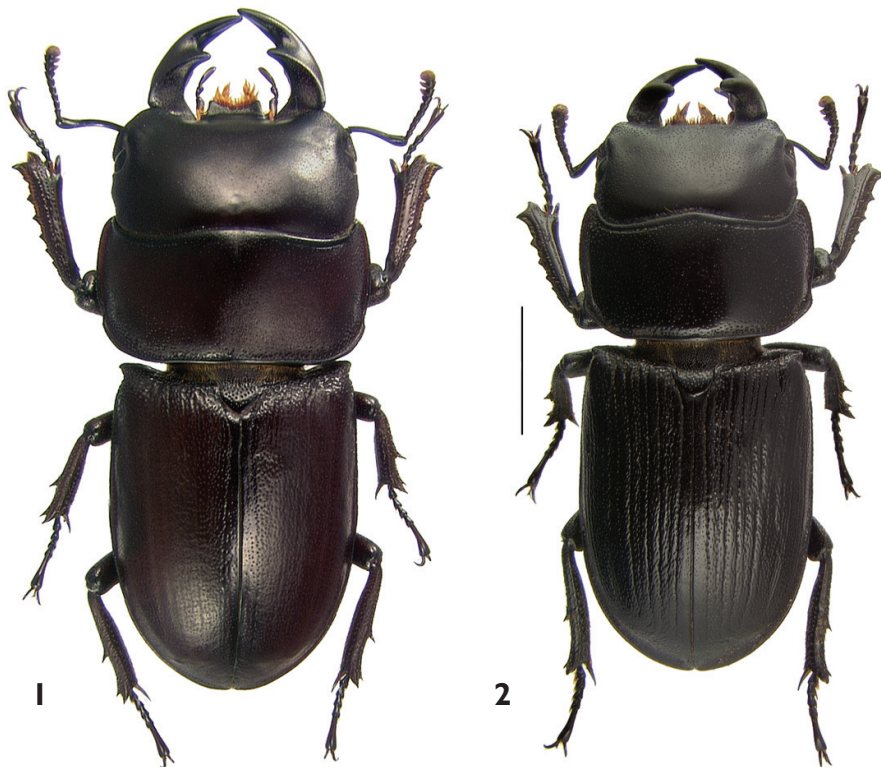
Figures 1–2. Dorsal habitus of major males. 1 Dorcus brevis (length 30mm) 2 Dorcus parallelus (length 26mm). Scale bar = 5mm.

(Fig. 3). In D. parallelus , the angles are distinctly removed from the base of the elytra (Fig. 4). The humeral angles of D. brevis are generally more strongly dentate and the humeri produced forward of the scutellum, while in D. parallelus the humerus is less strongly dentate and more or less in line with the scutellum. In addition, males of D. parallelus have a dense field of setae on the internal face of the metatibia (Fig. 5), but this patch is not present on males of D. brevis (Fig. 6). The clypeus is distinctly broader in males of D. parallelus .