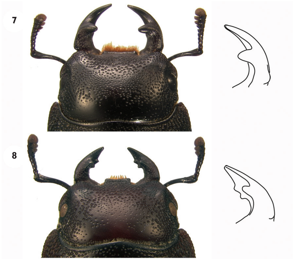
Figures 7–8. Head of minor males, dorsal view. Inset showing dentition of right mandible. 7 Dorcus parallelus 8 Dorcus brevis .

Dorcus carnochani Angell 1916: 70, synonym. Type material: Two syntype males and one syntype female, possibly located in storage at the Brooklyn Museum, not examined.