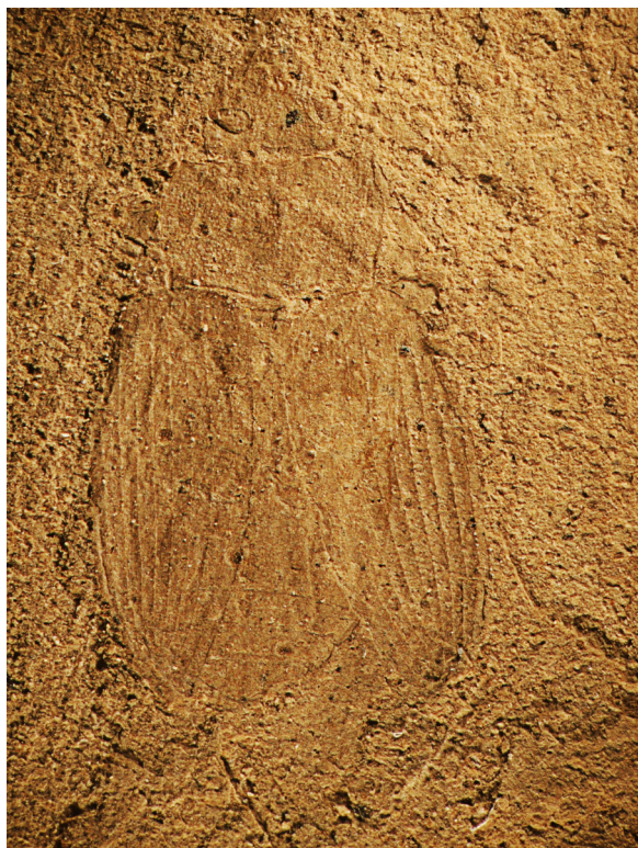
Fig. 3. Cryptohelops menaticus gen. et sp. n. from Palaeocene of Menat, holotype, body dorsally (counterpart).