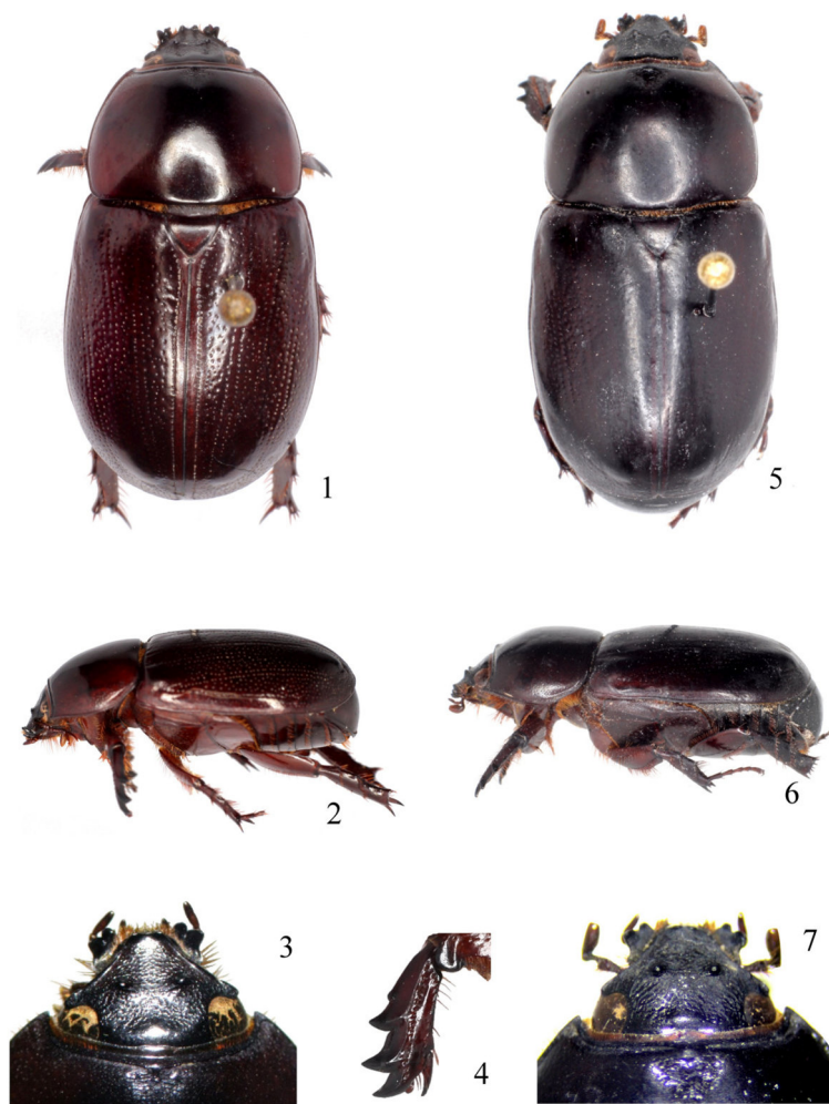
FIGURES 1–7. (1–4) Tomarus colombianus new species. Holotype: 1) habitus in dorsal view, 2) habitus in lateral view, 3) head in dorsal view, 4) protibia. (5–7) Tomarus laevicollis , male: 5) habitus in dorsal view; 6) habitus in lateral view; 7) head in dorsal view.

Type material. Holotype male at CIUQ labeled “COLOMBIA: Dep. Valle del Cauca / Buenaventura / La Bocana / 16.iv.2004 / Light trap / 5 m altitude/Serna F. Coll / CIUQ 1505”. Allotype female at CIUQ labeled “COLOMBIA: Dep. Valle del Cauca / Buenaventura / La Bocana / 15.iv.2004 / Light trap / 2 m altitude / Rivas L. Coll / CIUQ 1504”. One paratype male at CIUQ labeled “COLOMBIA: Dep. Valle del Cauca / Buenaventura / La Bocana / 17.iv.2004 / Hand collecting / 5 m altitude / Serna F. Coll / ICN-MHN”. One paratype female at ICN-MHN labeled “COLOMBIA: Dep. Valle del Cauca/Buenaventura / La Bocana / iv.2004 / Light trap / 2 m altitude / Mendoza L. Coll / CIUQ 1507”. One paratype female at ICN-MHN labeled “COLOMBIA: Dep. Huila / Neiva / 5.iii.1974 / Bagos A. I. Coll / ICN-MHN”.