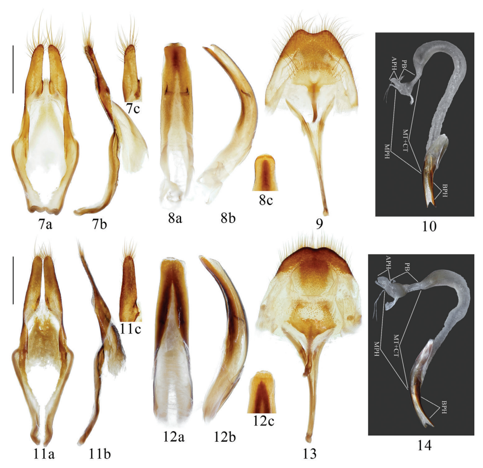
Figures 7–14. Male genitalia of the Microcriodes spp. 7–10 M. sikkimensis Breuning, 1943 11–14 M. wuchaoi sp. n. 7,11 tegmen 8,12 median lobe 9,13 Tergite VIII with sternites VIII & IX 10,14 endophallus in non-everted condition. a vetral view b lateral view c antero-dorsal view. Scale 1 mm. 10,14 not to scale.

covered with grayish yellow appressed pubescence. Vertex with two vittae behind upper eyelobes only sparsely pubescent. Antenna with scape covered with same kind of pubescence as head; other parts covered with fine grayish pubescence. Pronotum covered with same kind of pubescence as head except for a median longitudinal glabrous area. Scutellum densely clothed with recumbent pubescence. Elytron densely covered with grayish yellow appressed pubescence, provided with two bright yellow, irregularly shaped maculae on basal one-third and basal two-third near lateral margin; with small, round, yellow spots scattered mainly around suture and near apex.