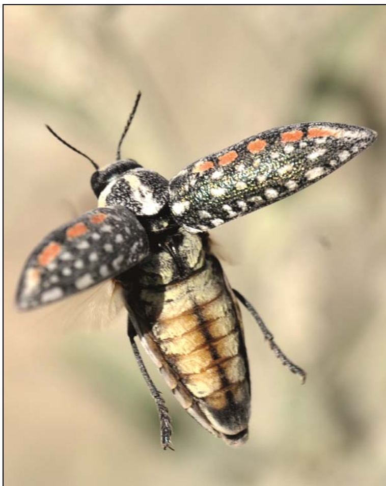
Plates 2: Julodis fimbriata lacunosa Fairmaire, UAE, near al-Ain.

Host plant: Larval development is outside plant roots in the soil.