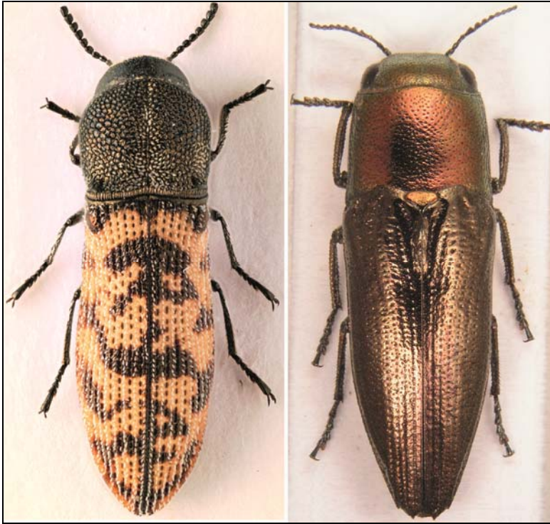
Plates 4–5. 4: Acmaeoderella (Omphalothorax) longissima longissima (Abeille de Perrin), ♀, 7.2 mm, UAE, Jebel Jibir; 5: Sphenoptera (Chrysoblemma) batelkai Kalashian sp. nov., holotype ♀, 10.5 mm, UAE, Wadi Wurayah.

angles. Anterior margin slightly biarcuate, bordered with medially widely interrupted, thin sulcus. Posterior margin biarcuate, median projection of moderate width, with almost truncate apex. Lateral carinae slightly S-shaped, anteriorly reaching nearly anterior 2/5 of pronotum, from above visible up to approximately posterior 1/4 of pronotum. Pronotum moderately, nearly regularly convex. Macropunctures on disk rather large and moderately dense, becoming slightly smaller and sparser medially, laterally fused into long sinuous, irregular, longitudinal rugae. Micropunctures moderately dense, denser and more distinct than those on frons. Scutellum transversely pentagonal, flattened with few indistinct micropunctures and small, sparse, very shallow macropunctures.