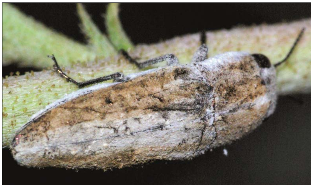
Plates 6–7: Sphenoptera (Hoplistura) gnezdilovi Kalashian, UAE, Sameih (photograph by R. Breithaupt).

km SE of Hisn al Abr), 15°52'N 47°40'E, 745 m, 2♂, 1♀, ex larvae, 5.iv.2007, leg. S. Kadlec; the same but 1♀, Acacia sp., leg. P. Kabátek; the same but 1♀, 9.x.2005, Acacia sp., leg. P. Kabátek. Host plant: Acacia tortilis (Fabaceae) (Obenberger, 1920; Alfieri, 1976); Acacia spp. (Fabaceae) (see also Halperin & Argaman, 2000).