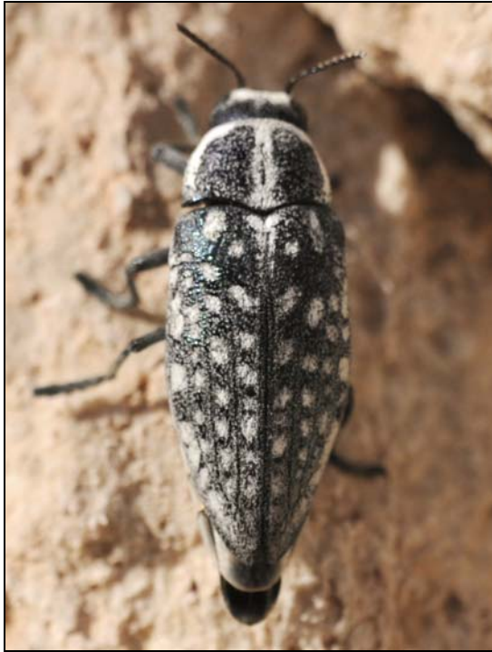
Plate 3: Julodis fimbriata lacunosa Fairmaire, UAE, near al-Ain.