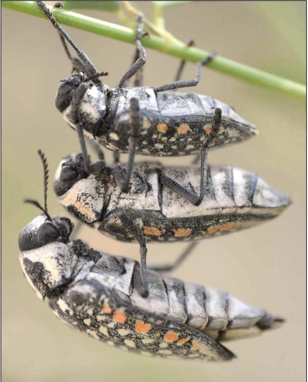
Plate 1: Julodis fimbriata lacunosa Fairmaire, UAE, near al-Ain.

Remarks: The ornithologist Huw Roberts took superb images of Julodis fimbriata lacunosa in nature (Plates 1–3) in April, 21–28, 2010 and confirmed in this way the occurrence of this species in the UAE (see Bílý et al., 2011: 175–176). Unfortunately, no specimens were taken for the collection.