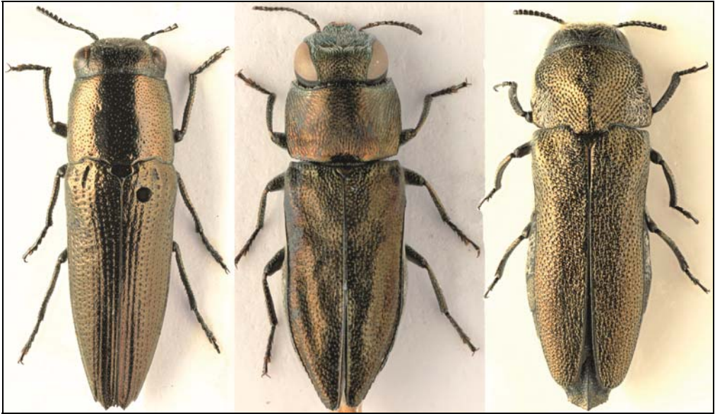
Plates 8–10. 8: Sphenoptera (Hoplistura) khartoumensis Obenberger, ♀, 8.1 mm, UAE, Wadi Hayl; 9: Anthaxia (Haplanthaxia) kneuckeri kneuckeri Obenberger, ♀, 4.7 mm, UAE, Jebel Hafit; 10: Meliboeus (Meliboeus) margotanus (Novak), ♀, 5.9 mm, UAE, Jebel Jibir.

Distribution: Egypt (Alfieri, 1976), Israel, Jordan, Oman, Saudi Arabia, Sinai, Sudan, UAE, Yemen. New species for the UAE, Sudan and Yemen.