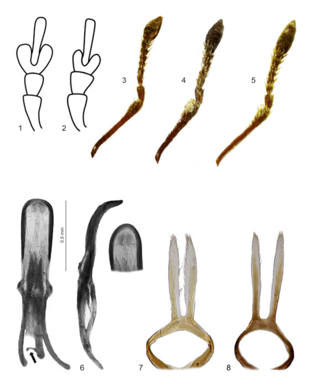
Figs. 1–2: Protarsus of 1) Acentrus histrio and 2) A. zarathustra sp.n.