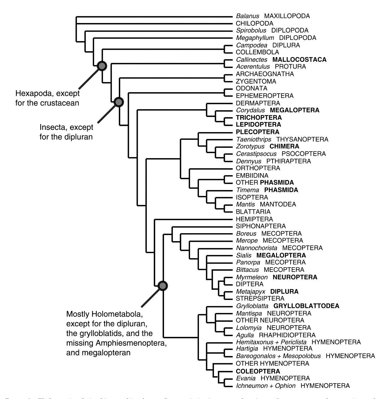
FIGURE 2. Phylogenetic relationships resulting from a direct optimization approach, using uniform gapcost to change ratios, and equal weighting for transitions and transversions, modified from Figure 13 of Wheeler et al. (2001). Some of the taxa that most systematists would consider misplaced are in bold.

It is difficult to compare these results with previous results. A decision over which of the hypotheses is "best" is dependent on one's beliefs about how the data should be analyzed. Figure 2 shows the results of a direct optimization analysis (POY) of the 18S, using equal costs for gaps, and all substitution types (Wheeler et al., 2001; their Fig. 13). This is not a fair comparison, because the 18S fragment used in these analysis is considerably