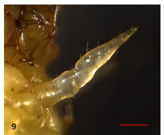
Images 5–9. Head and mouth parts of IIIrd instar larva of Scaptodera rhadamistus .