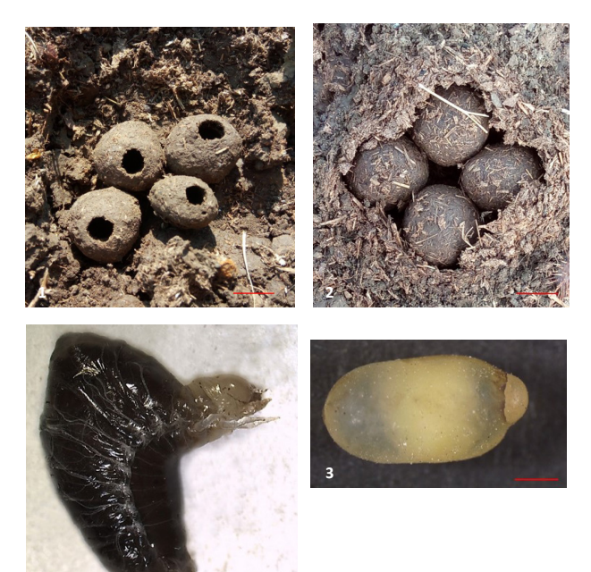
Images 1–4. Brood balls of Scaptodera rhadamistus . 1 - hatched brood balls; 2 - unhatched brood balls; 3 - egg; 4 - IIIrd instar larva. (Scale 1 & 2 = 1cm; 3 & 4 = 1mm).

dark spots present transversally; femora of fore-, midand hind legs orange; fore-tibia setose, tridentate, with elongate tooth; tibia, tarsi and claws of fore-, mid- and hind legs brownish-black; abdominal sclerites metallic greenish-black, pygidium dark, with fine, evenly spread punctuations.