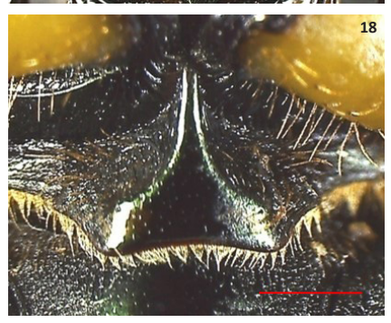
Images 16–18. Scaptodera rhadamistus (female) 16 - dorsal view; 17 - pronotum;

16 - dorsal view; 17 - pronotum; 18 - large posterior process on mesosternum (Scale = 1mm).