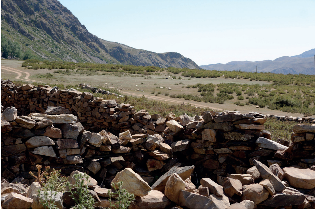
Fig. 22. Habitat of Carabus ( Trachycarabus ) mandibularis abakkereiorum subsp. nov. on the right bank of the Kran River.

Eyes markedly protruding. Labial tooth narrow, acute, shorter than the lateral lobes. Antennae surpassing pronotal base by 3.5 distal segments.