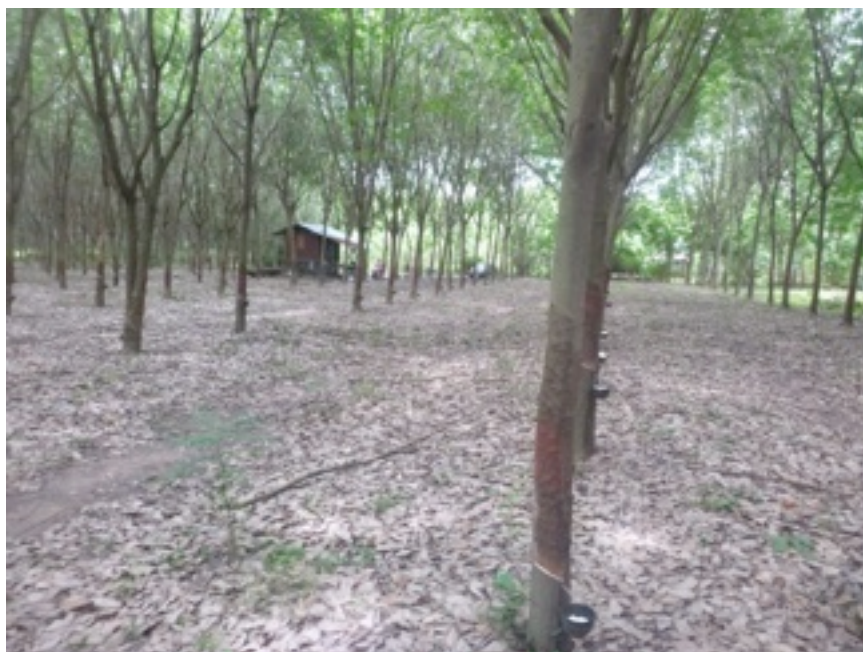
Fig. 3. View of the rubber plantation near Ubon Ratchathani, Ubon Ratchathani Province, north-eastern Thailand, July 2017. Note cleared understory and deep mat of dead leaves from the rubber trees on the ground, a good habitat for many species of fauna. (Photograph: T.J. Hawkeswood).