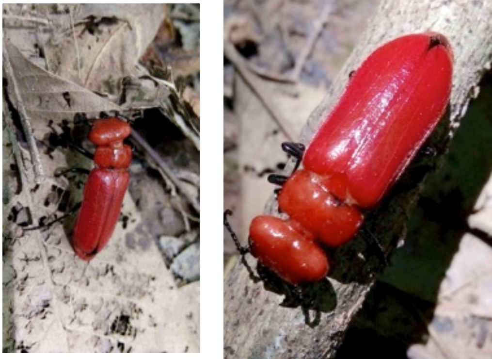
Fig. 1. Adult of Synhoria maxillosa (Fabricius, 1801) crawling on the ground amongst dead leaves and other debris on 17 August 2017 at 10.43 AM (Thailand time), within a dark rubber plantation, Hevea brasiliensis Muell. Arg. (Euphorbiaceae) within the farming district near Ubon Ratchathani, Ubon Ratchathani Province, north-eastern Thailand. (Photograph: B. Sommung). Fig. 2. Closer view of the same adult beetle resting on a stick within the rubber plantation. (Photograph: B. Sommung).

to be widely distributed in nearby Malaysia (Mohamedsaid, 1982); in Kuala Lumpur (16 February 1940), a specimen was discovered dropping from a roof, and somewhere in Sarawak, on 14 April 1963, a specimen was caught flying indoors at night. Adults therefore appear to be active both diurnally and nocturnally.