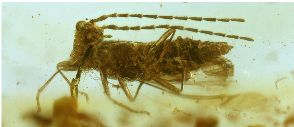
Fig. 2. Malthodes meriae sp. nov.: Holotype, ventral view.