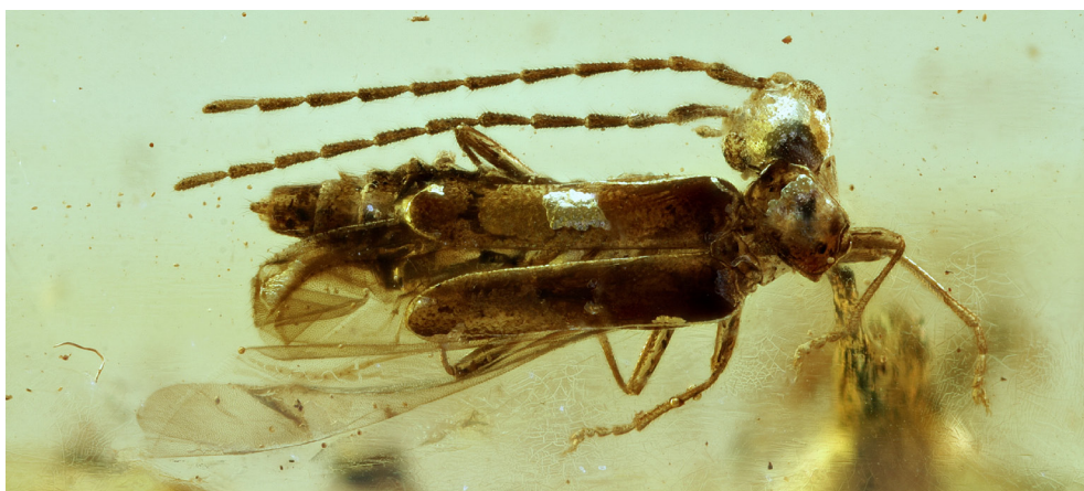
Fig. 1. Malthodes meriae sp. nov.: Holotype, dorsal view.

Penultimate tergite (tg9) robust, subquadrate, with margins equipped with setae; last tergite (tg10) very narrow, slightly elongated and lobe-shaped, at apex submillimetrically forked and equipped with long setae; last sternite (st9) elongated, narrow, not curved,