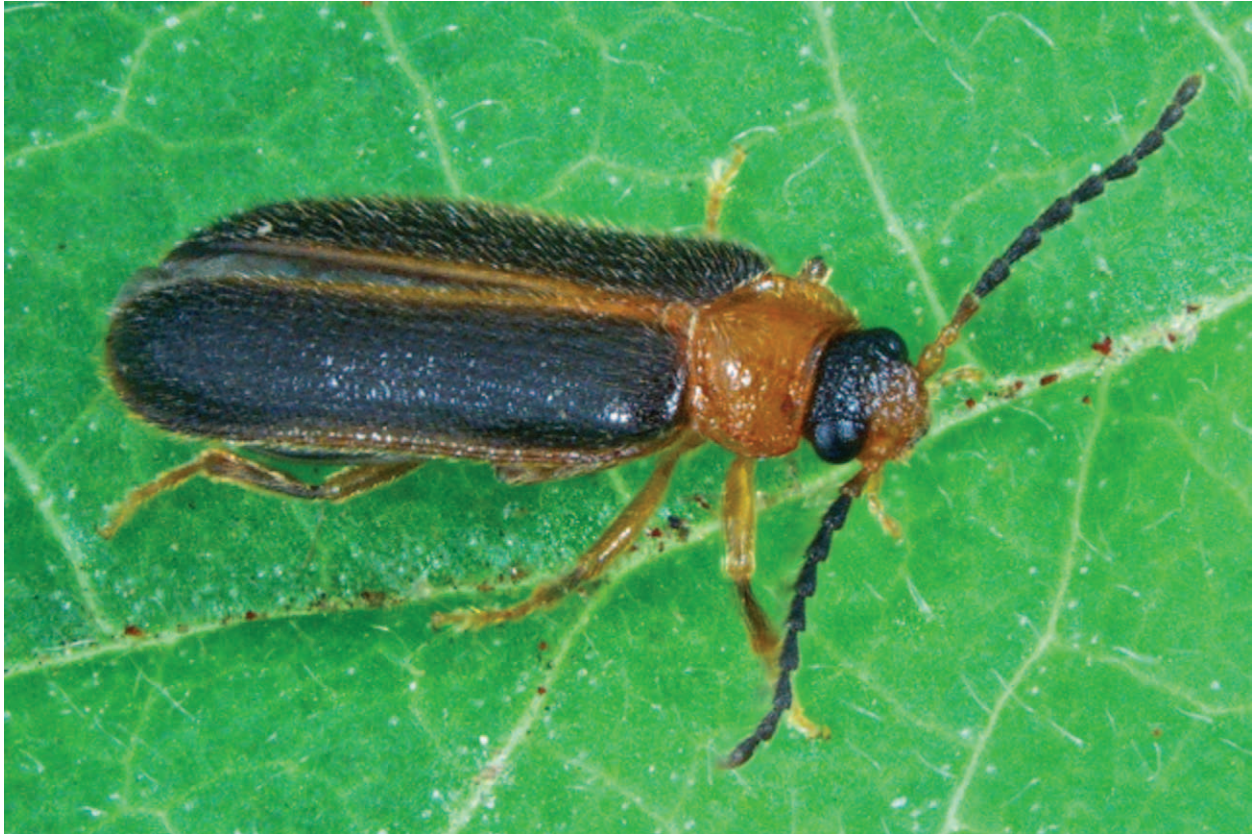
Figure 1. Omethes marginatus LeConte.

ifera Linnaeus), and white oak ( Quercus alba Linnaeus), a population that is considered to be a mature hardwood forest in Indiana (McCormick 1962). The understory is predominantly flowering dogwood ( Cornus florida Linnaeus) and maple-leaf viburnum ( Viburnum acerifolium Linnaeus) (McCormick 1962). In addition, Shades and the surrounding area contain some remnant populations of Eastern hemlock ( Tsuga canadensis (Linnaeus) Carriere), Eastern white pine ( Pinus strobus Linnaeus), and Canada yew ( Taxus canadensis Marshall).