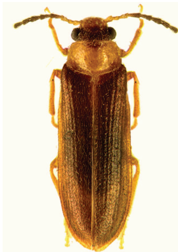
Figure 2. Omethes marginatus LeConte (used with permission, CSIRO, Australia).