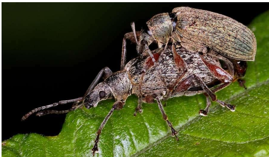
Figure 2. Mating Phyllobius glaucus (Scopoli, 1763); female to the left, male to the right.

Structures used in copulation (Figure 2) and reproduction have widespread use for insect identification (Hoffmann 1950, 1954; Tuxen 1970; Pajni et al. 1977; Ter-Minasyan 1978; Pesarini 1980; Caldara 1985, 1990; Sert and Çağatay 1999; Sert 1997, 2006; Yunakov and Korotyaev 2007). The genitalia of Phyllobius (Metaphyllobius) glaucus has been partially illustrated by several authors (Angelov 1976, Pesarini 1980, Yunakov and Korotyaev 2007) although some structures, such as the tegmen, parameres, manubrium, endophallus, ninth abdominal sternite, and the female genitalia remain undescribed, as far as we know. Herein, we describe and illustrate those structures for the first time as they are useful for separating P. glaucus from other congeners (Figures 3 and 4).