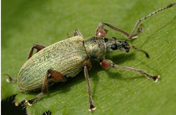
Figure 1. Phyllobius glaucus .

Species of the polyphagous weevil genus Phyllobius generally live on cultivated shrubs and trees, particularly those in the families Urticaceae, Betulaceae, Salicaceae, and Rosaceae (Pesarini 1980). Their larvae often feed on the roots and, upon reaching adulthood, the beetles are seen on the shoots (Dieckmann 1980, Ross 1963). Sometimes, both larvae and adults cause major economic damage, particularly when grazing on young plants. Phyllobius (Metaphyllobius) glaucus (Scopoli, 1763) thrives from plains to mountainous and even subalpine zones (Dieckmann 1980).