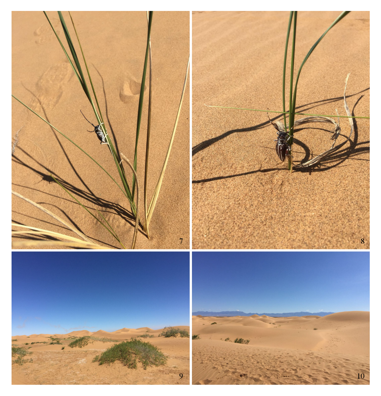
Figures 7–10. Biological pictures of Eodorcadion (Ornatodorcadion) zhaoi sp. nov. 7. Male on the food plant. 8. Female before oviposition. 9–10. Landscape of the localities.