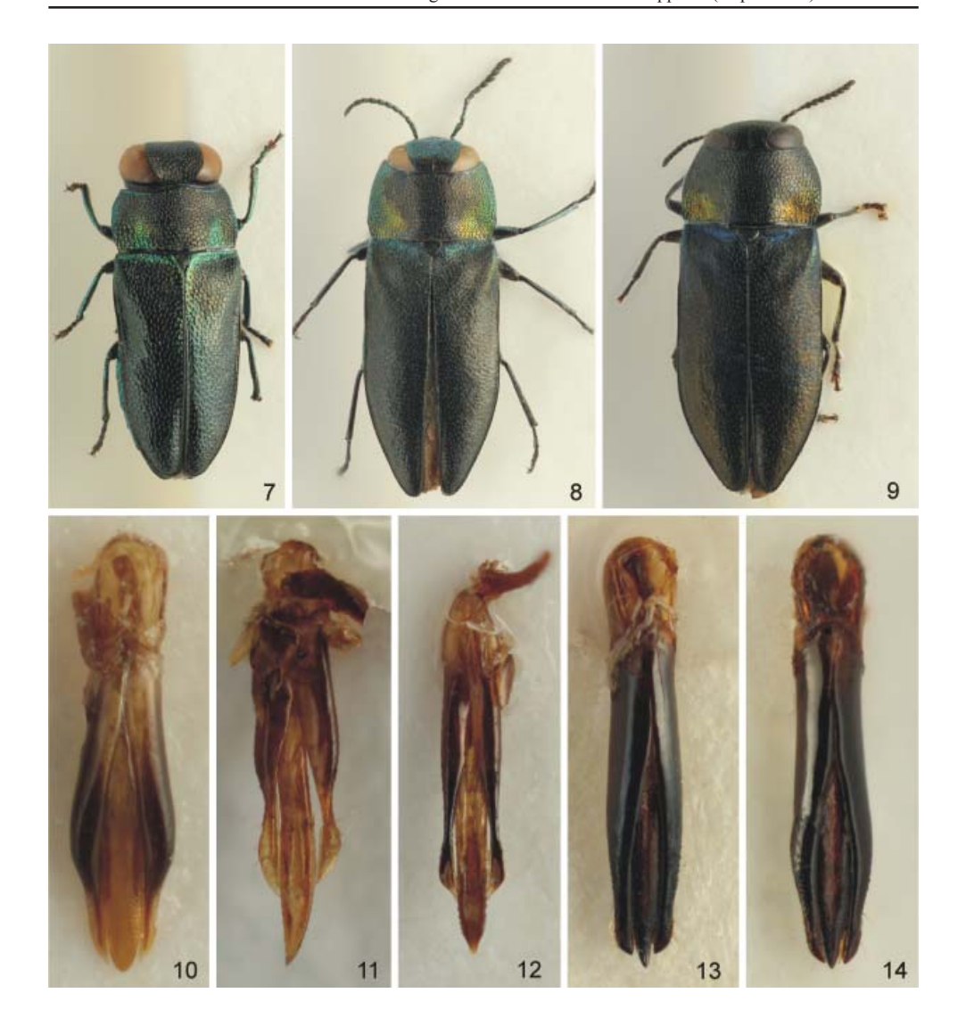
Figs. 7–14. 7–9 – Habitus. 7 – Anthaxia ( Haplanthaxia ) palawanensis sp. nov., holotype ( \circlearrowleft , 3.6 mm, Palawan); 8 – A. ( H. ) philippinensis sp. nov., holotype ( \circlearrowleft , 3.6 mm, Sibuyan); 9 – A. ( H. ) philippinensis sp. nov., allotype ( \updownarrow , 3.9 mm, Luzon). 10–14 – Aedeagi (not in the scale). 10 – A. ( H. ) palawanensis sp. nov., holotype; 11 – A. ( H. ) mindanaoensis Fisher, 1922, Mindoro; 12 – A. ( H. ) philippinensis sp. nov., holotype; 13 – A. ( H. ) boettcheri Obenberger, 1928, Luzon, Abra province; 14 – A. ( H. ) attenuata Fisher, 1922, holotype, Negros.