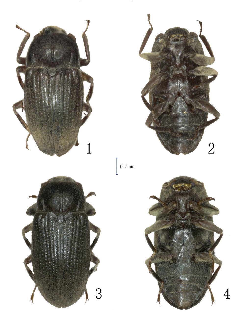
Figures 1–4. Habitus photographs. 1–2 Dryopomorphus heineri sp. n., holotype 3–4 Dryopomorphus ruiliensis sp. n., holotype 1, 3 in dorsal view 2, 4 in ventral view.